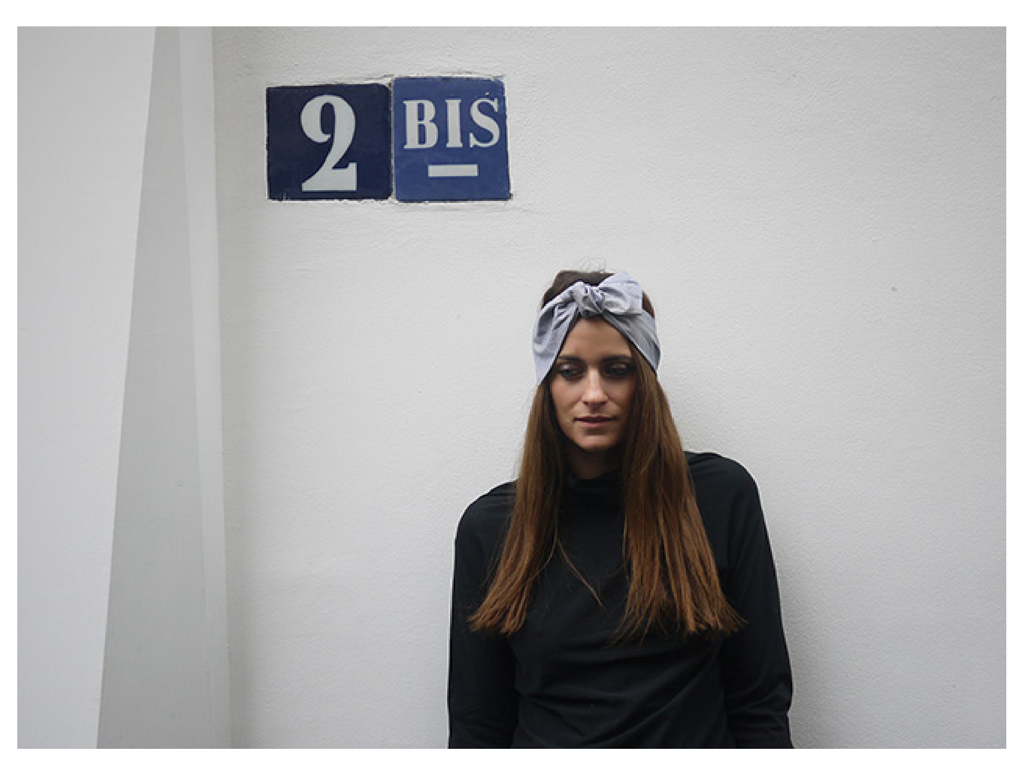
Headband Solene - Cotton Shirt fabric - Made in France