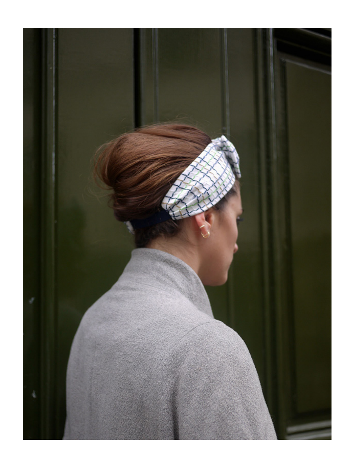
Headband Celine - Vintage 70s Tweed fabric - Made in France