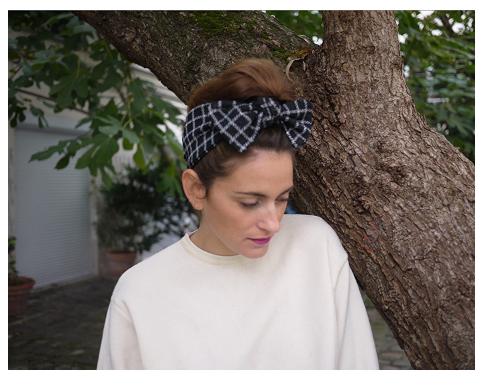
Headband Clemence - Knited fabric - Made in France