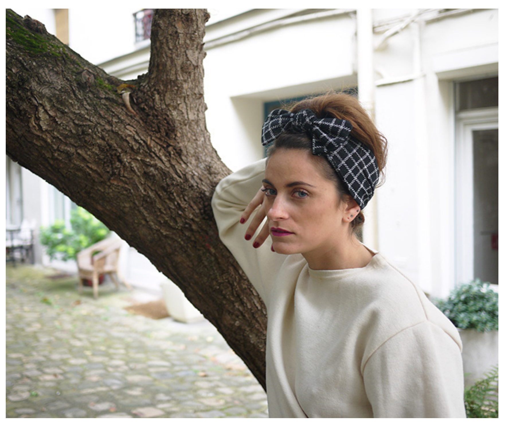
Headband Clemence - Knited fabric- Made in France