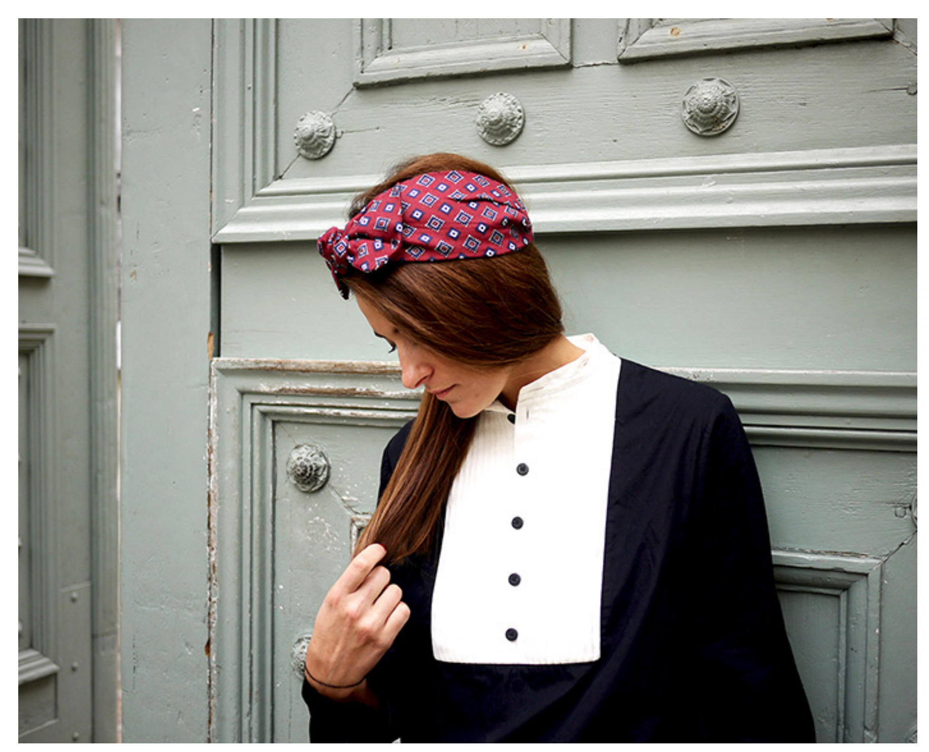
Headband Ines - Cotton fabric - Made in France