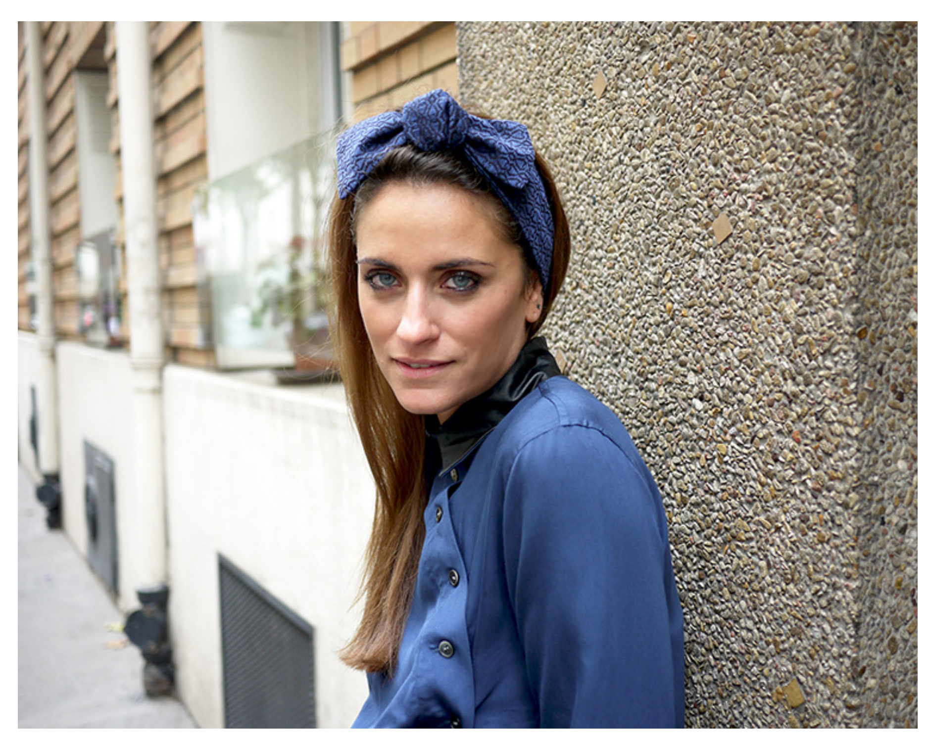
Headband Francoise - Jacquard fabric - Made in France