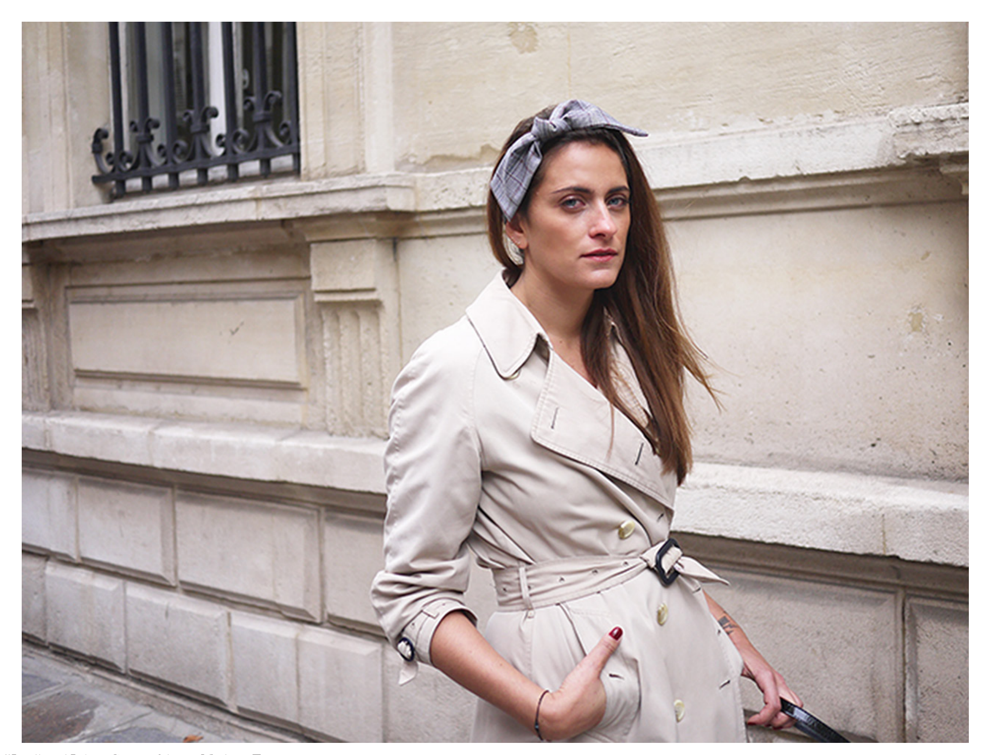
Headband Julie - Cotton fabric - Made in France