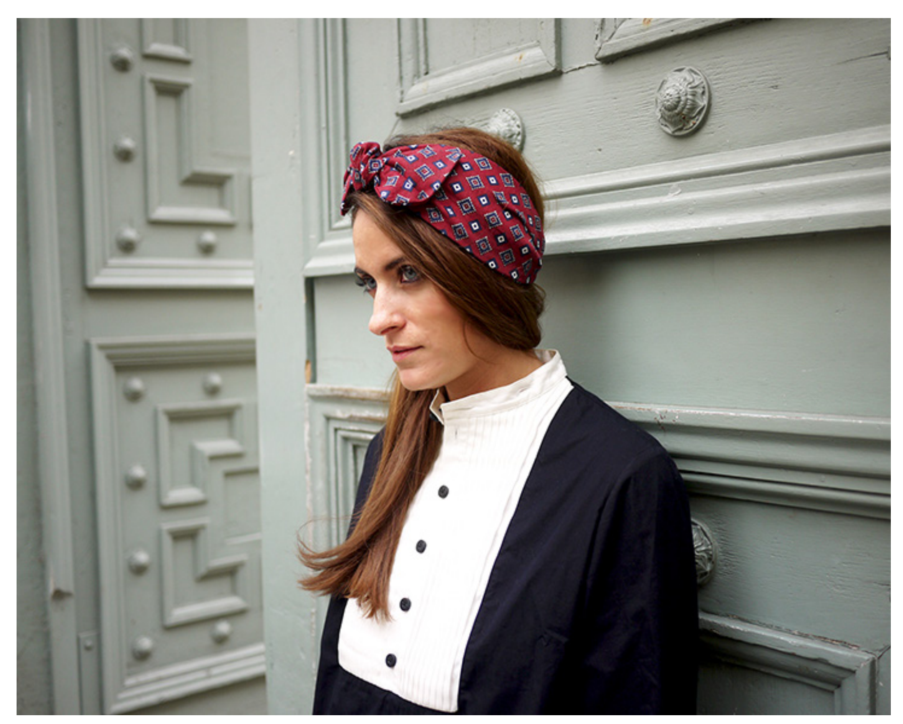
Headband Ines - Cotton fabric- Made in France