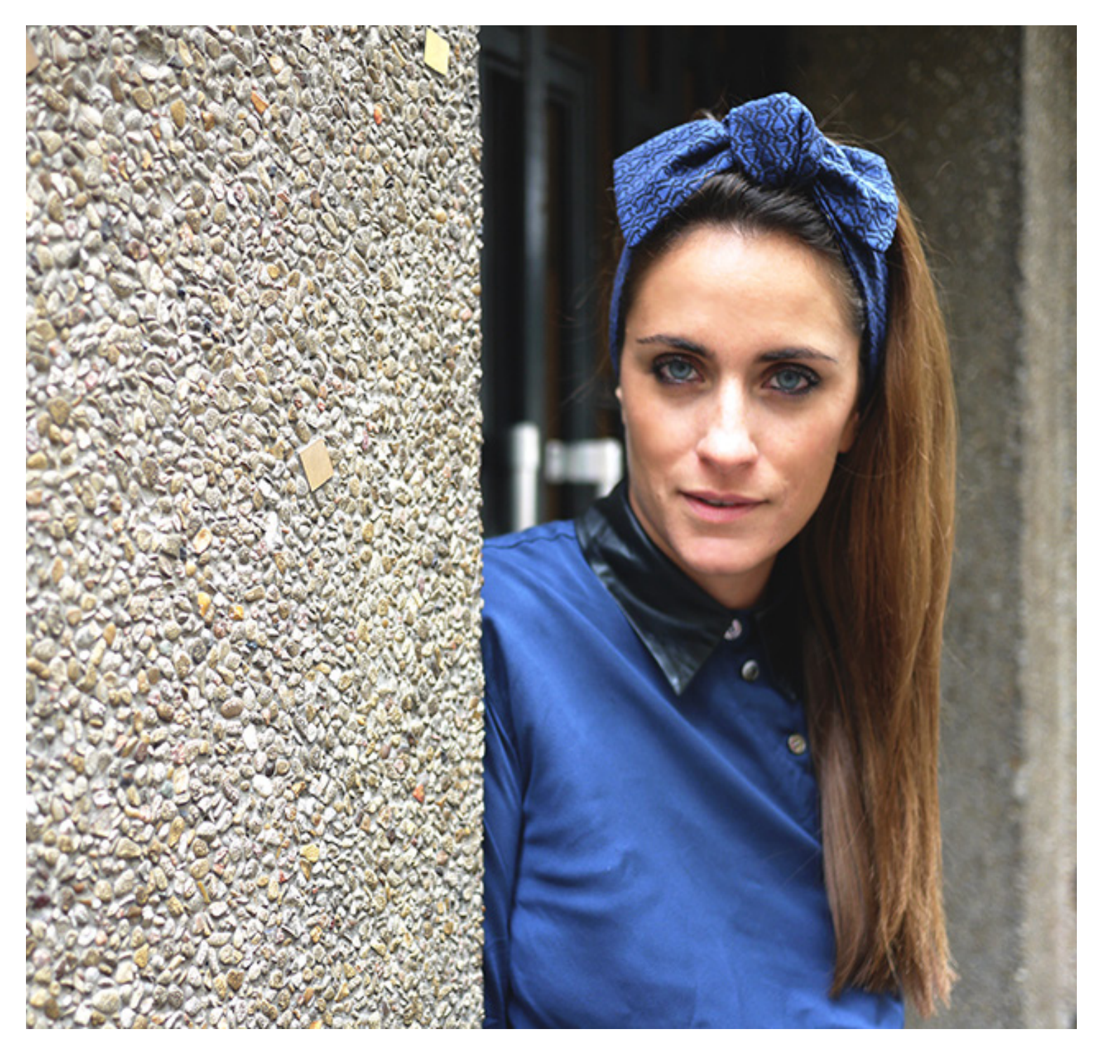
Headband Francoise- Jacquard fabric- Made in France