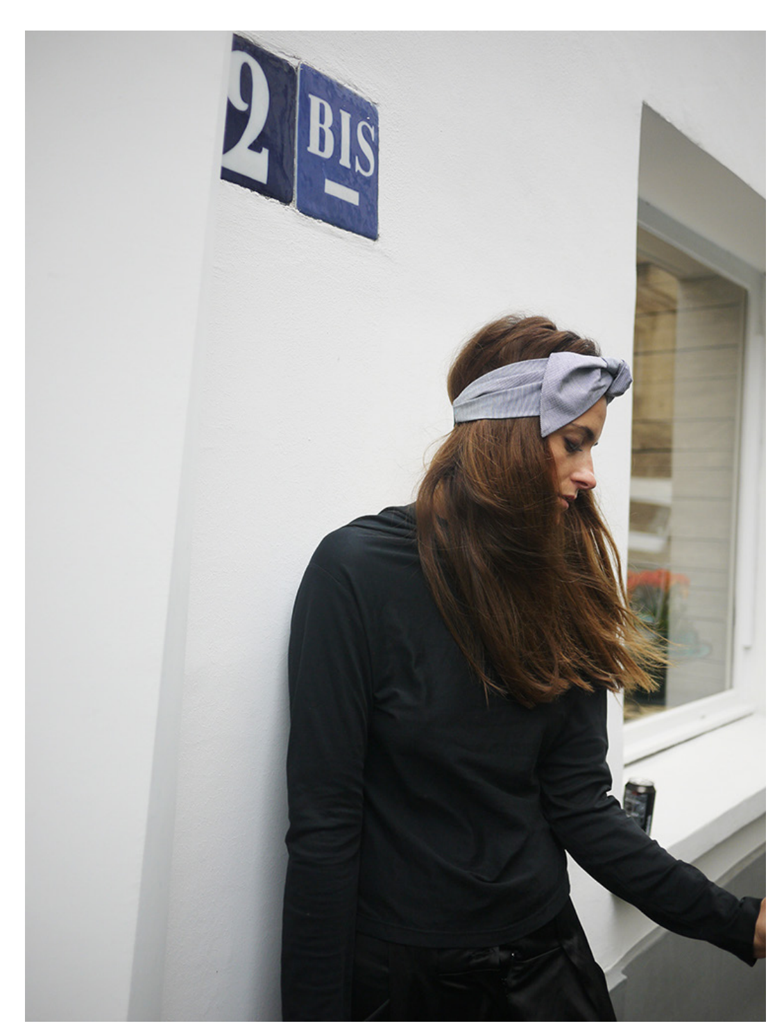
Headband Solene - Cotton Shirt fabric - Made in France