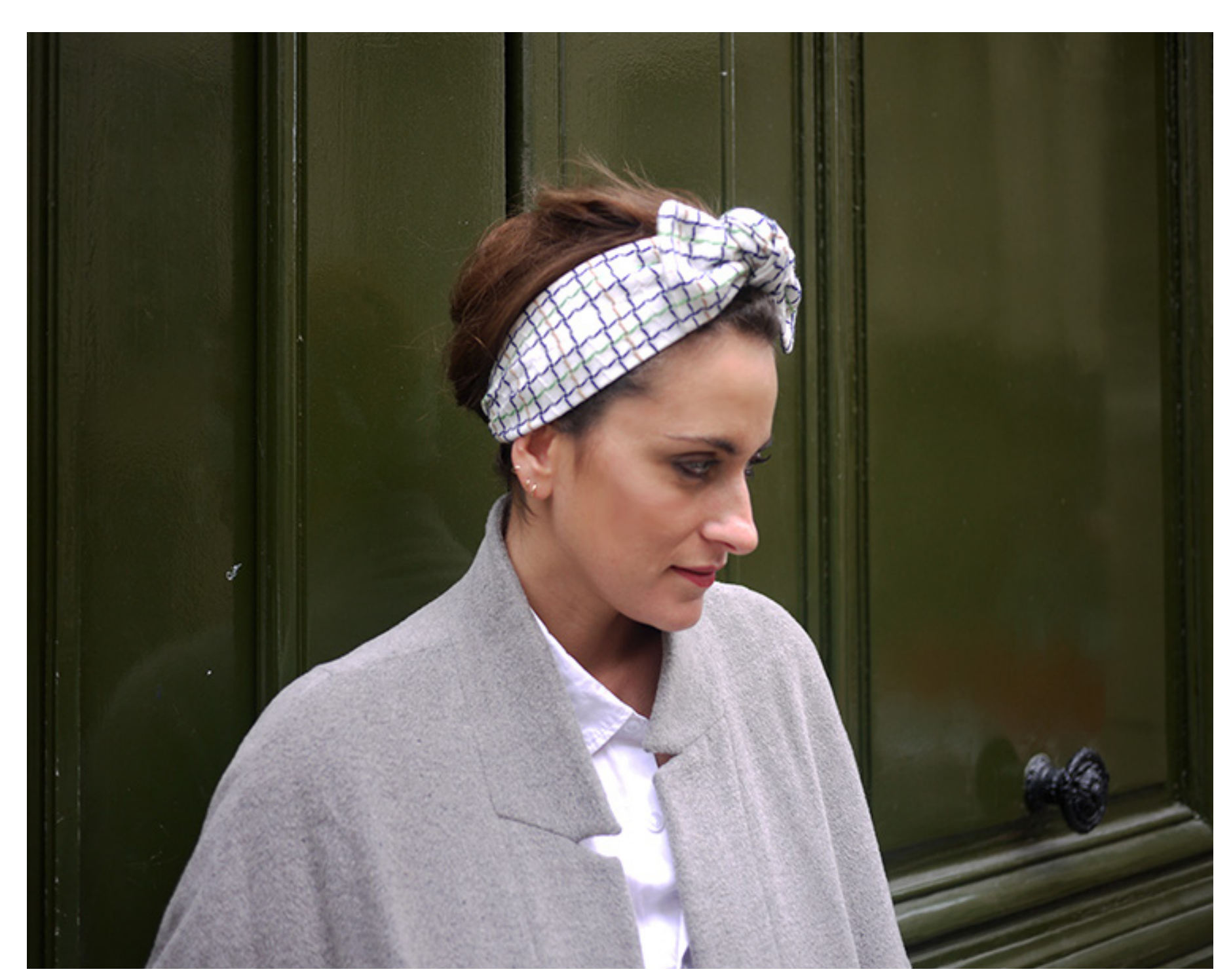
Headband Celine - Vintage 70s Tweed fabric- Made in France