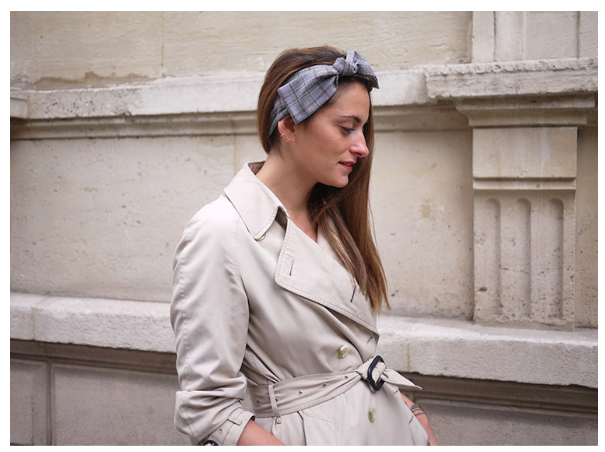
Headband Julie - Cotton fabric - Made in France