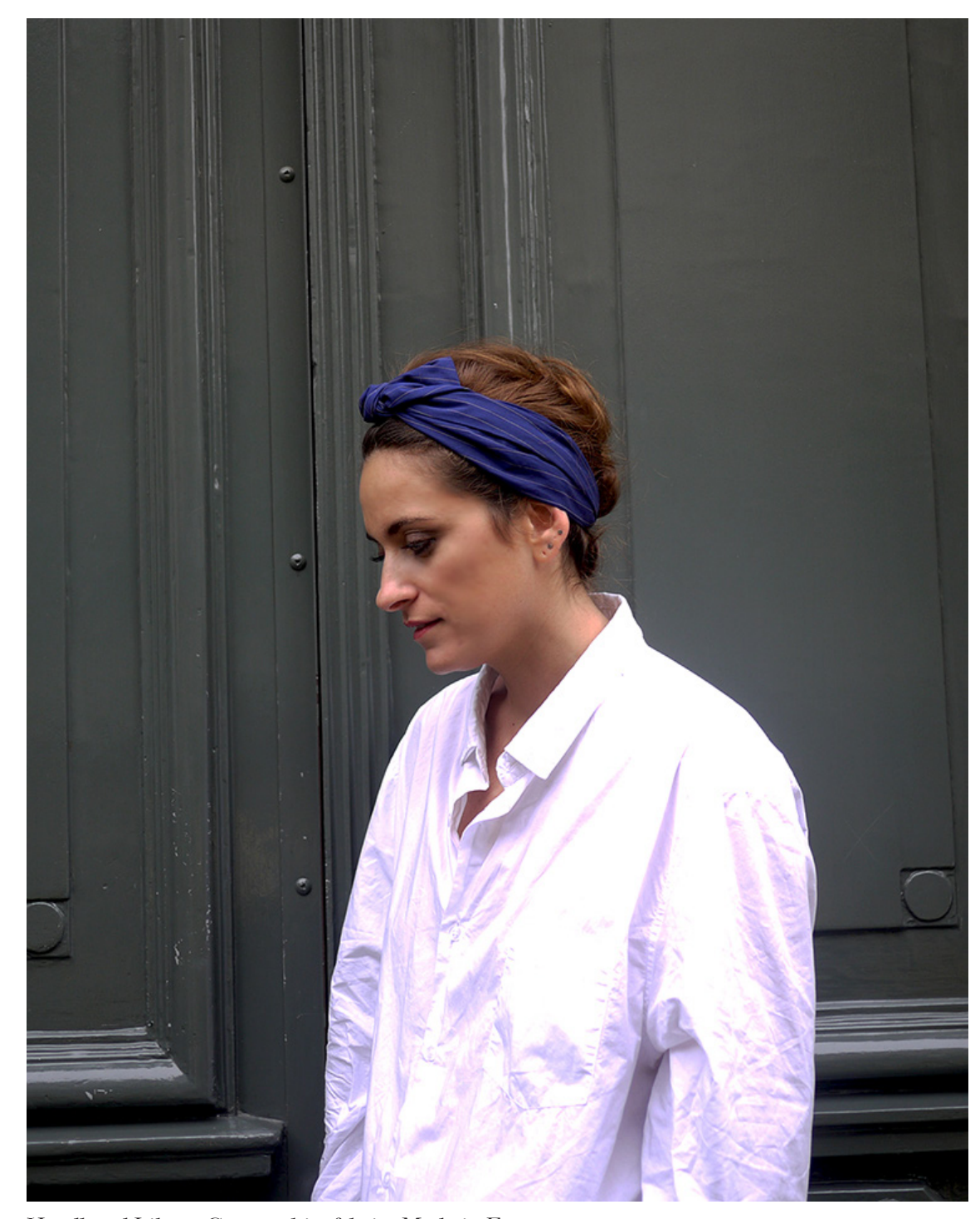
Headband Lilou - Cotton shirt fabric- Made in France