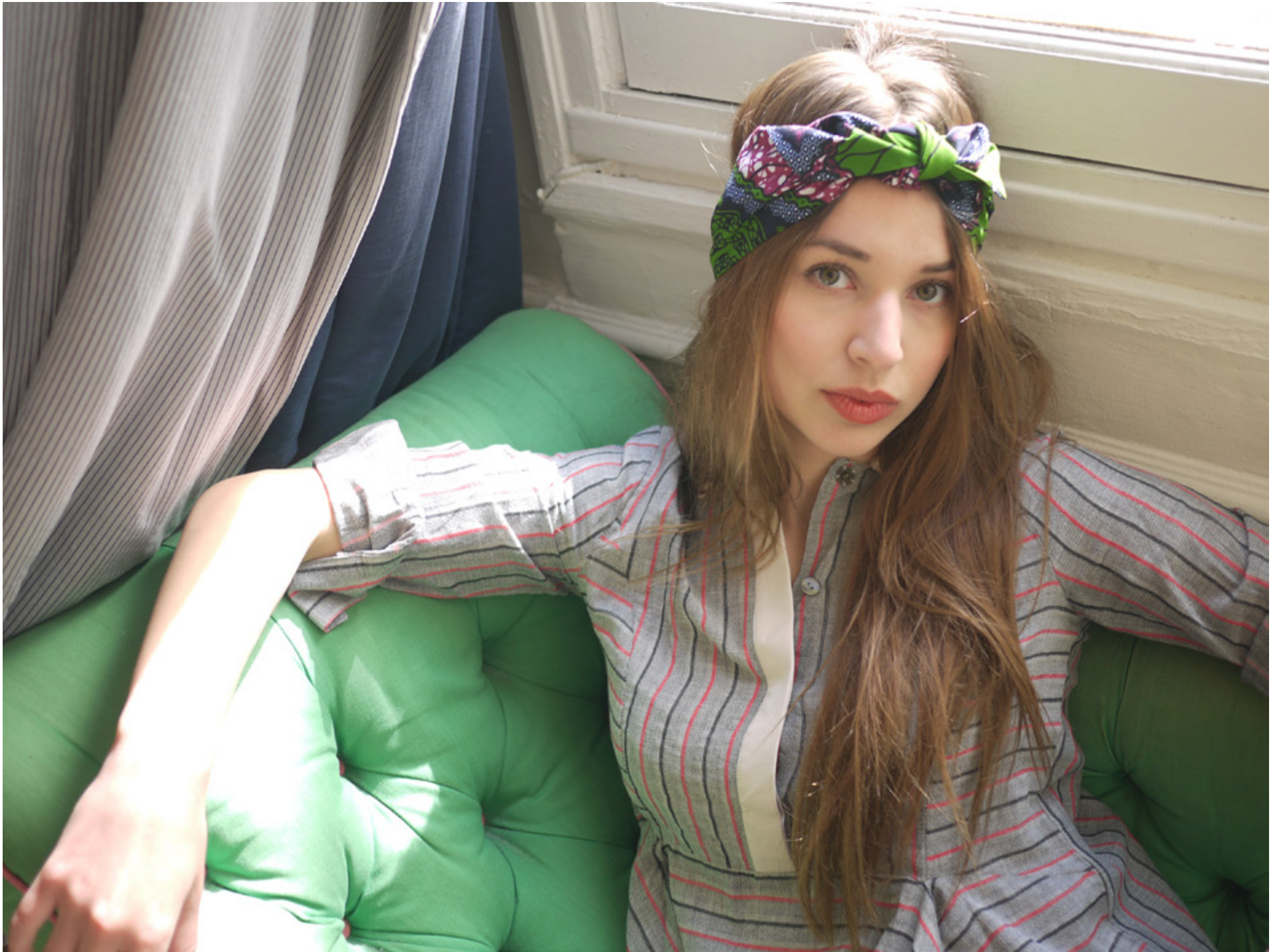
Headband Sonnet - Cotton Wax fabric - Handmade in France