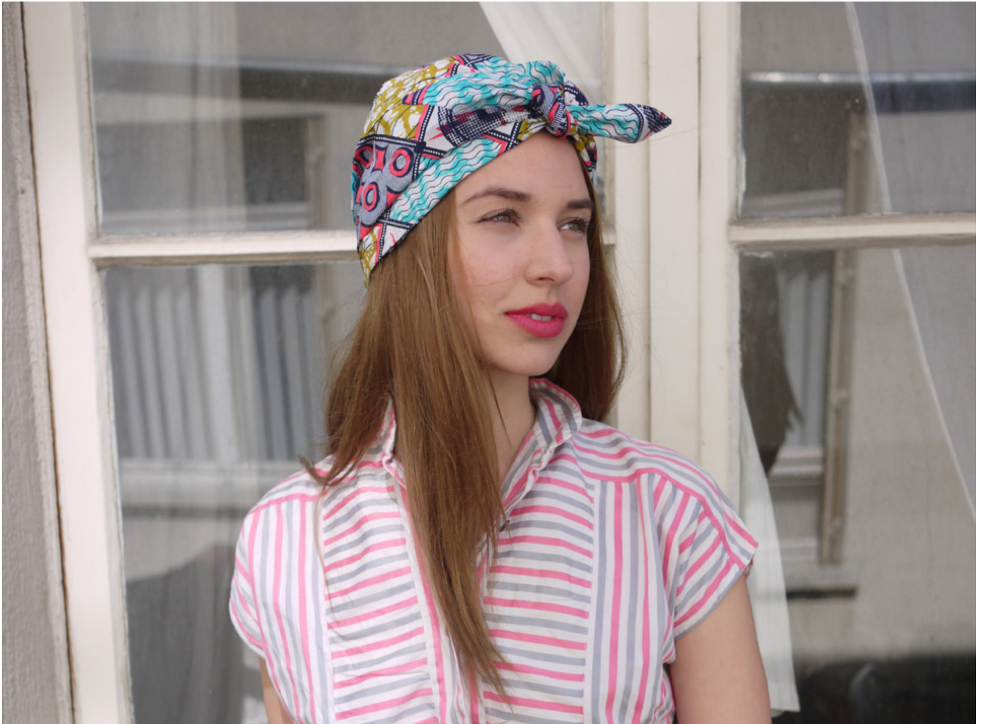
Turban Anise - Cotton Wax fabric - Handmade in France