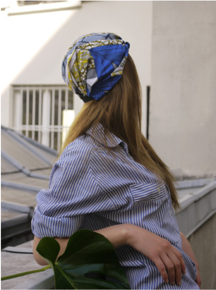
Turban Agantha - Cotton Wax fabric - Handmade in France