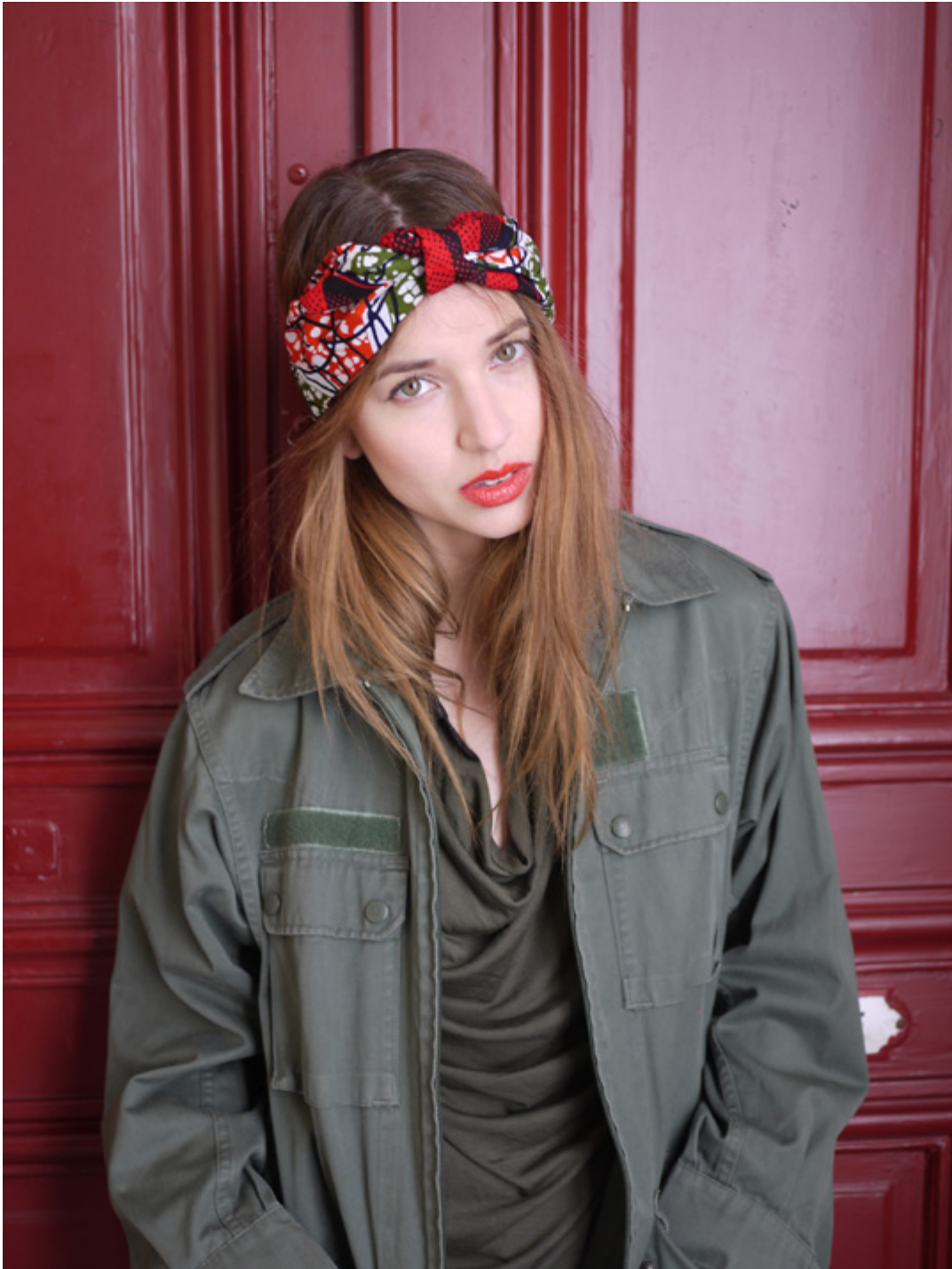
Headband Adora - Cotton Wax fabric - Handmade in France