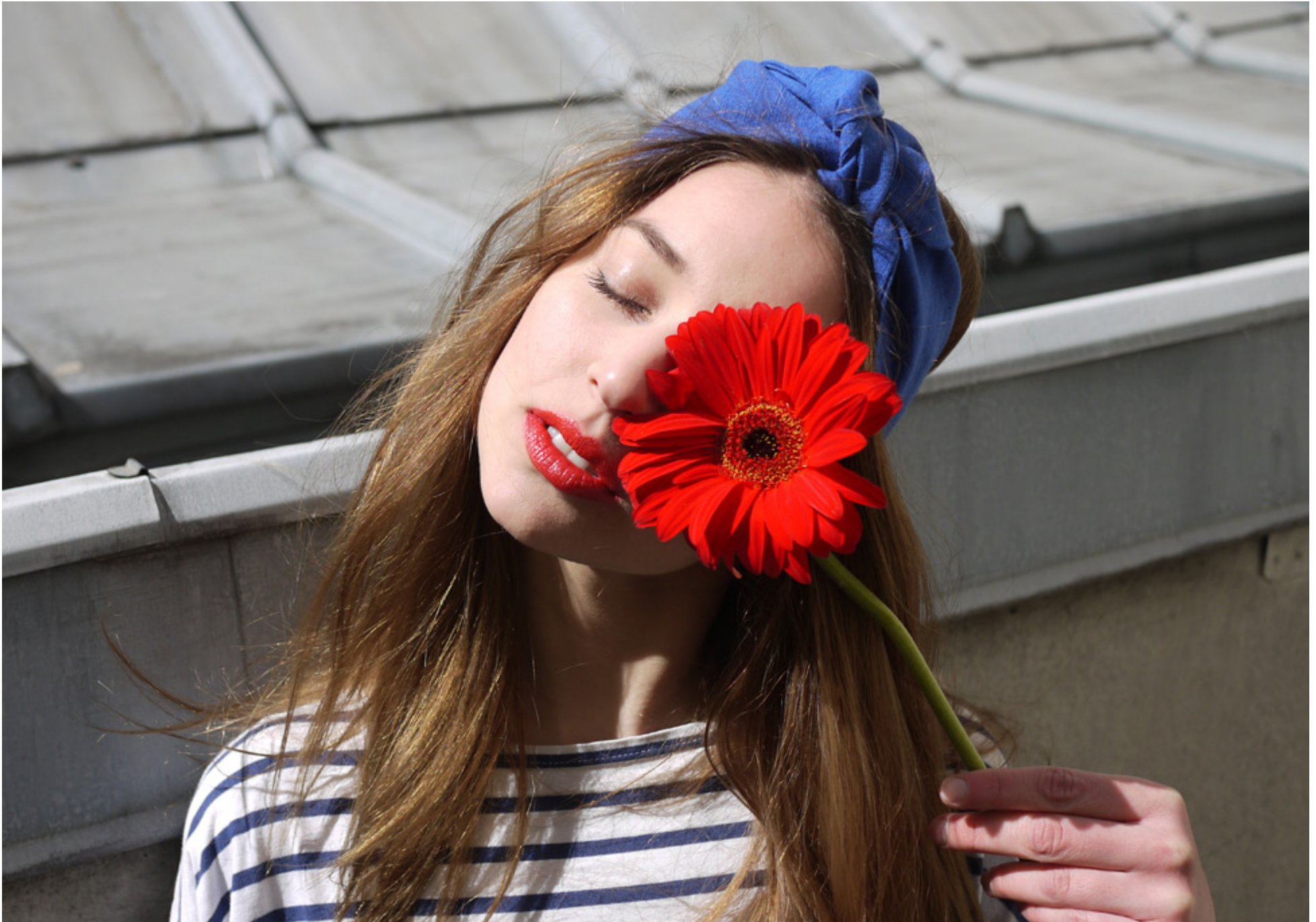
Headband Natalie - Linen fabric - Handmade in France