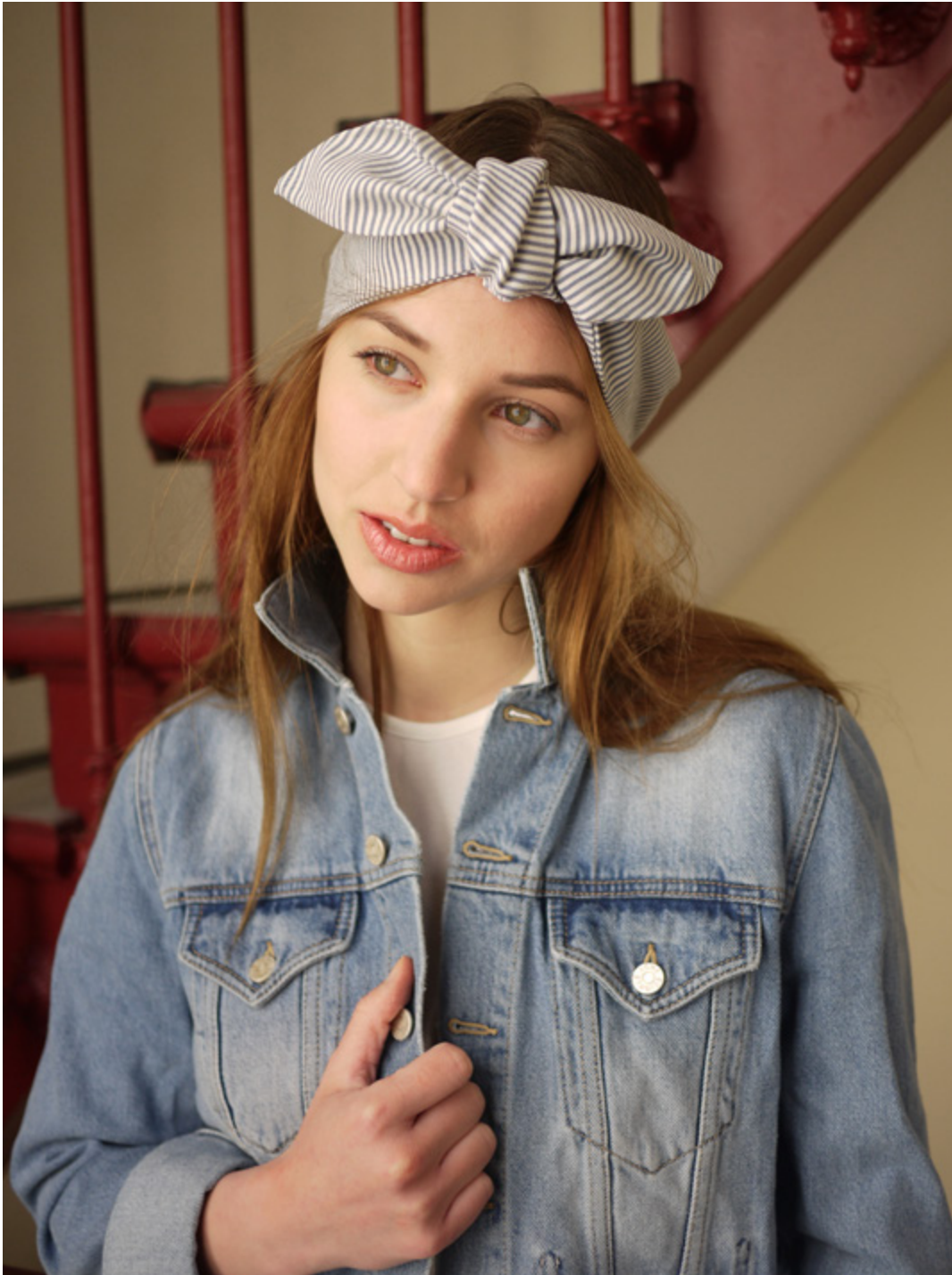
Headband Avirl - Cotton Stripes fabric - Made in France