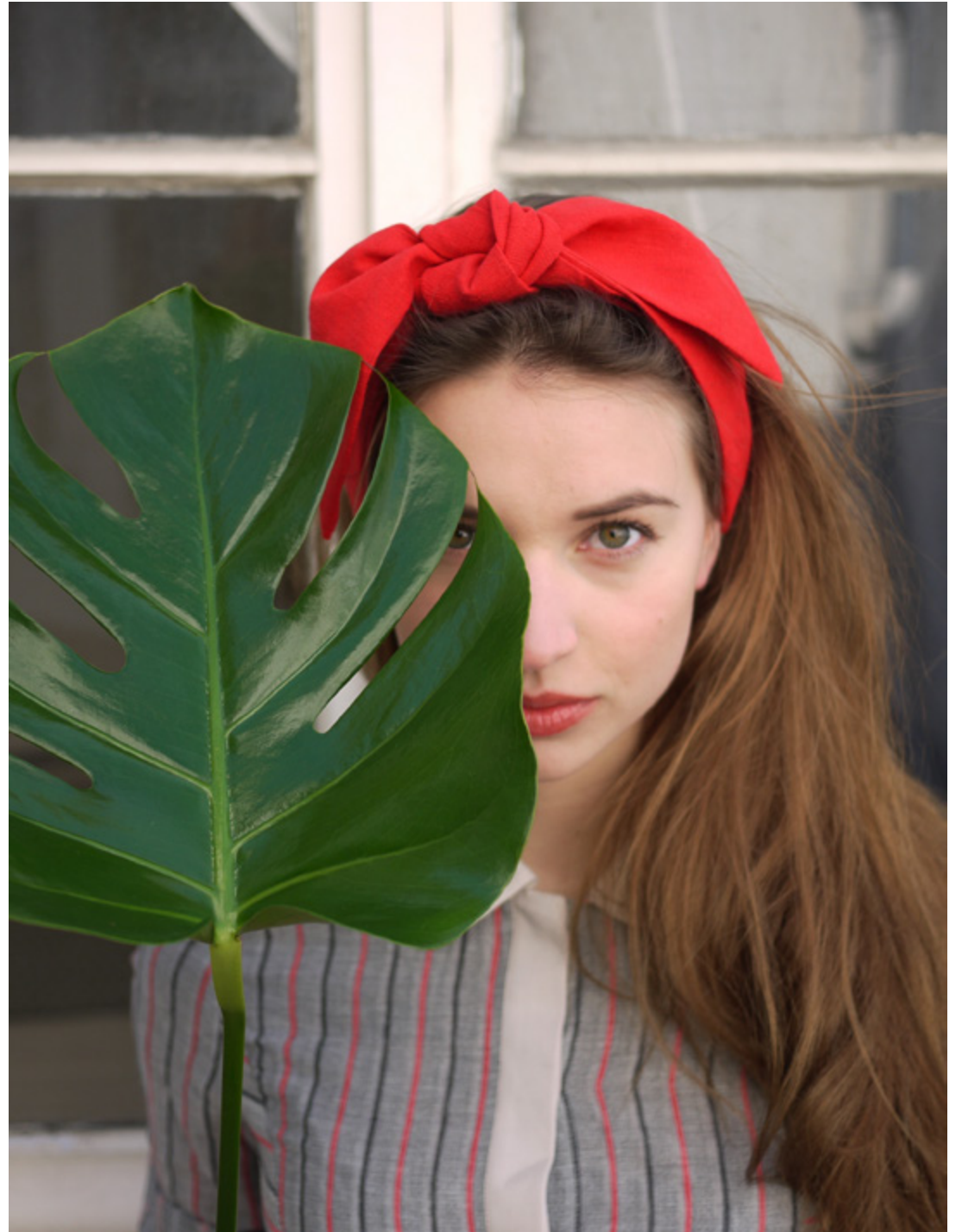
Headband Natalie - Linen fabric - Handmade in France