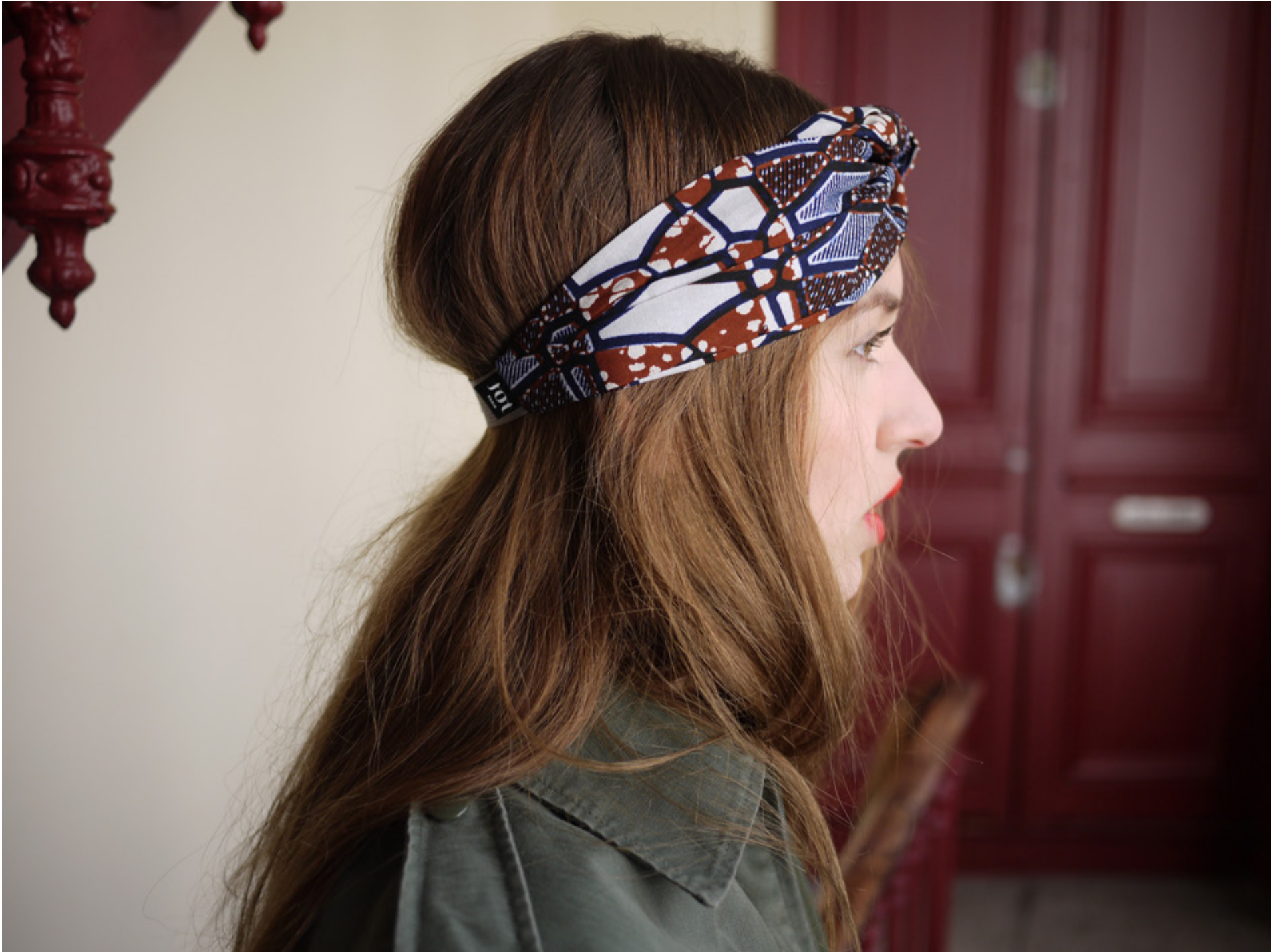
Headband Laurance - Cotton Wax fabric - Handmade in France