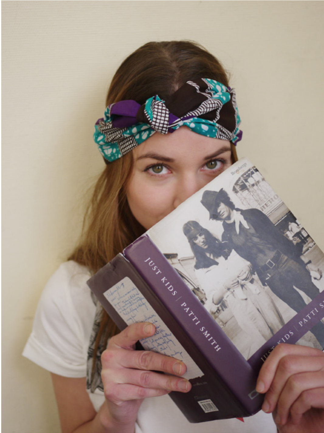
Headband Aricia - Wax fabric - Made in France