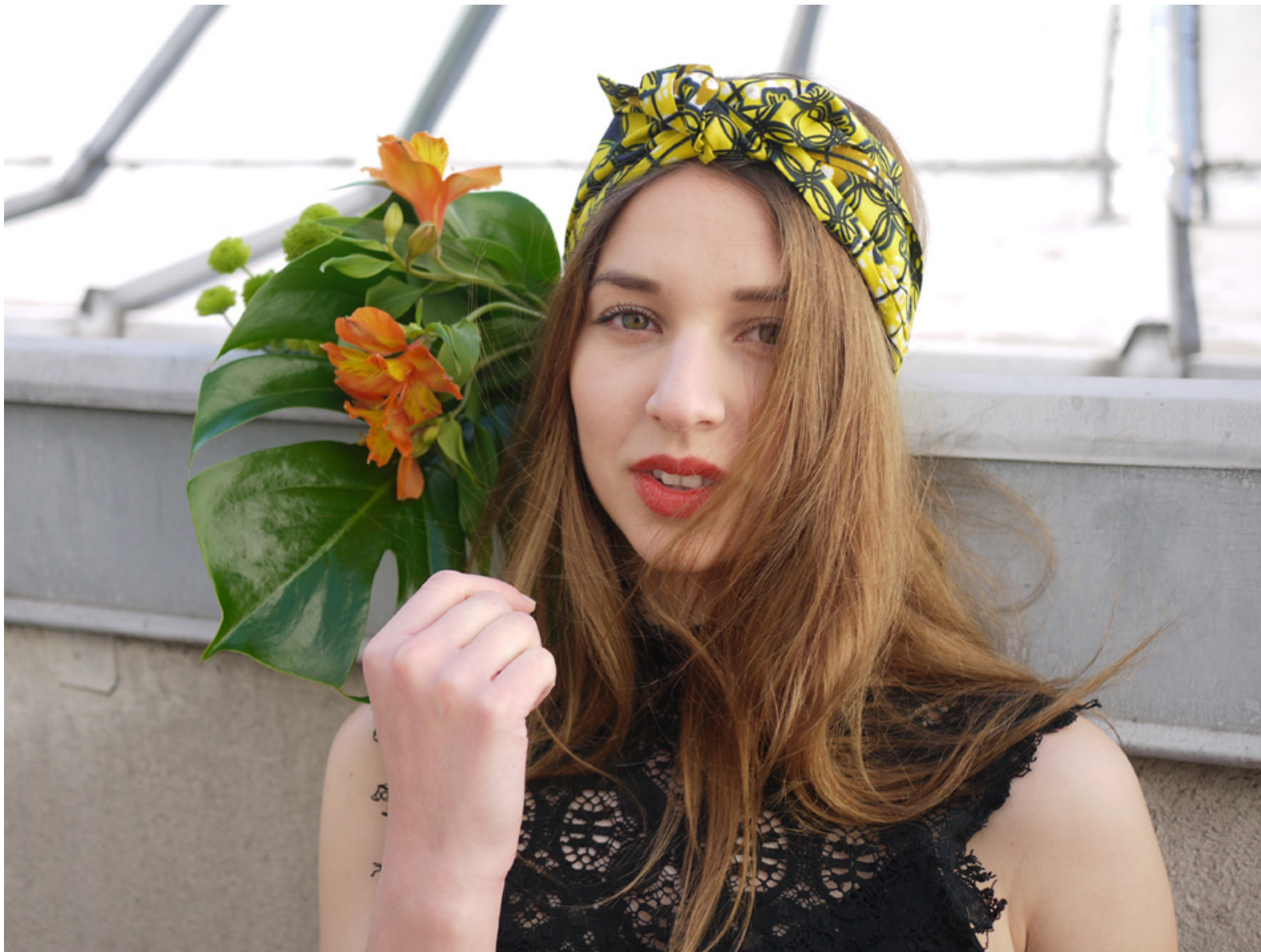
Headband Rita - Cotton Wax fabric - Handmade in France