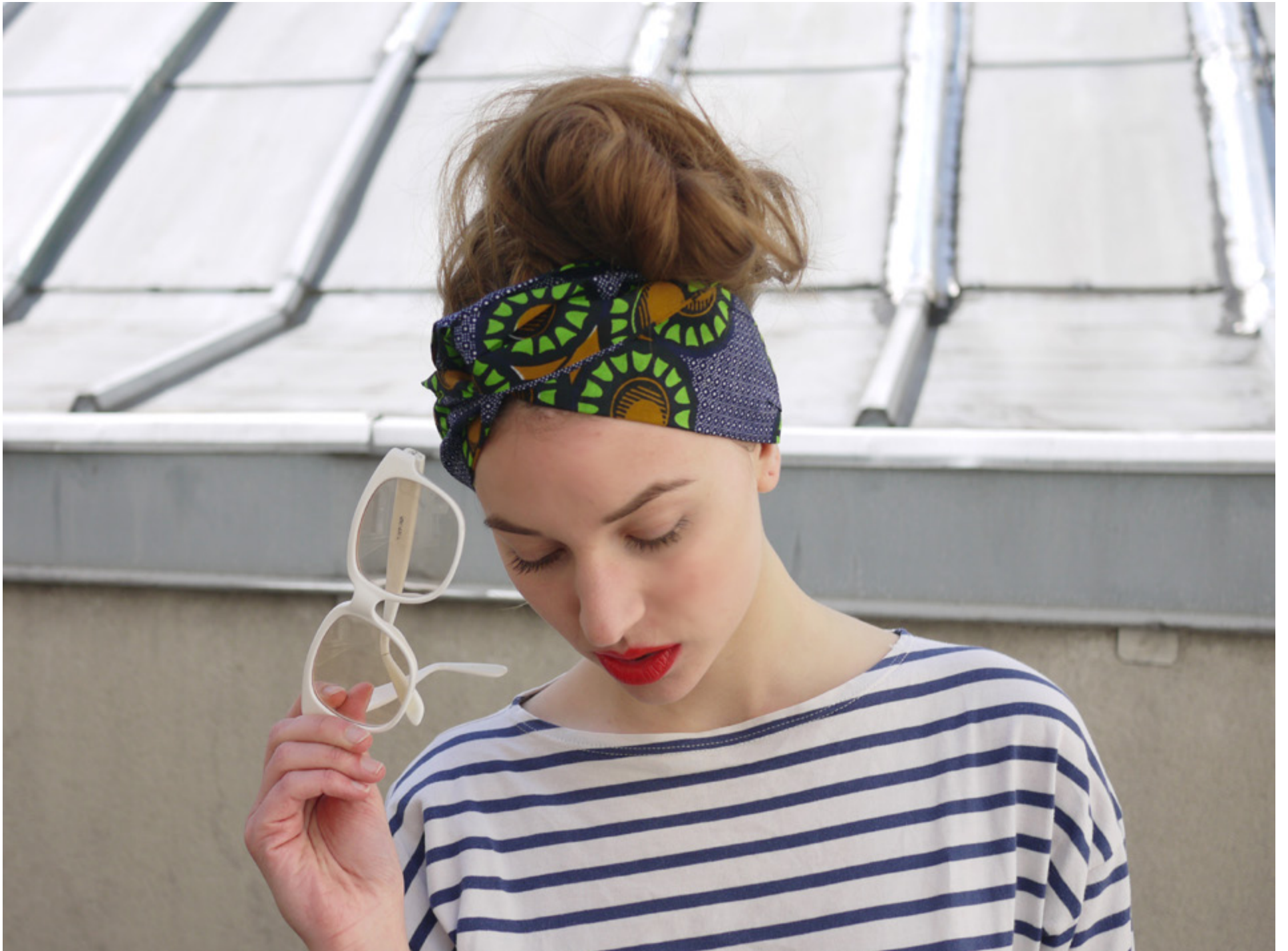
Headband Janice - Cotton Wax fabric - Handmade in France