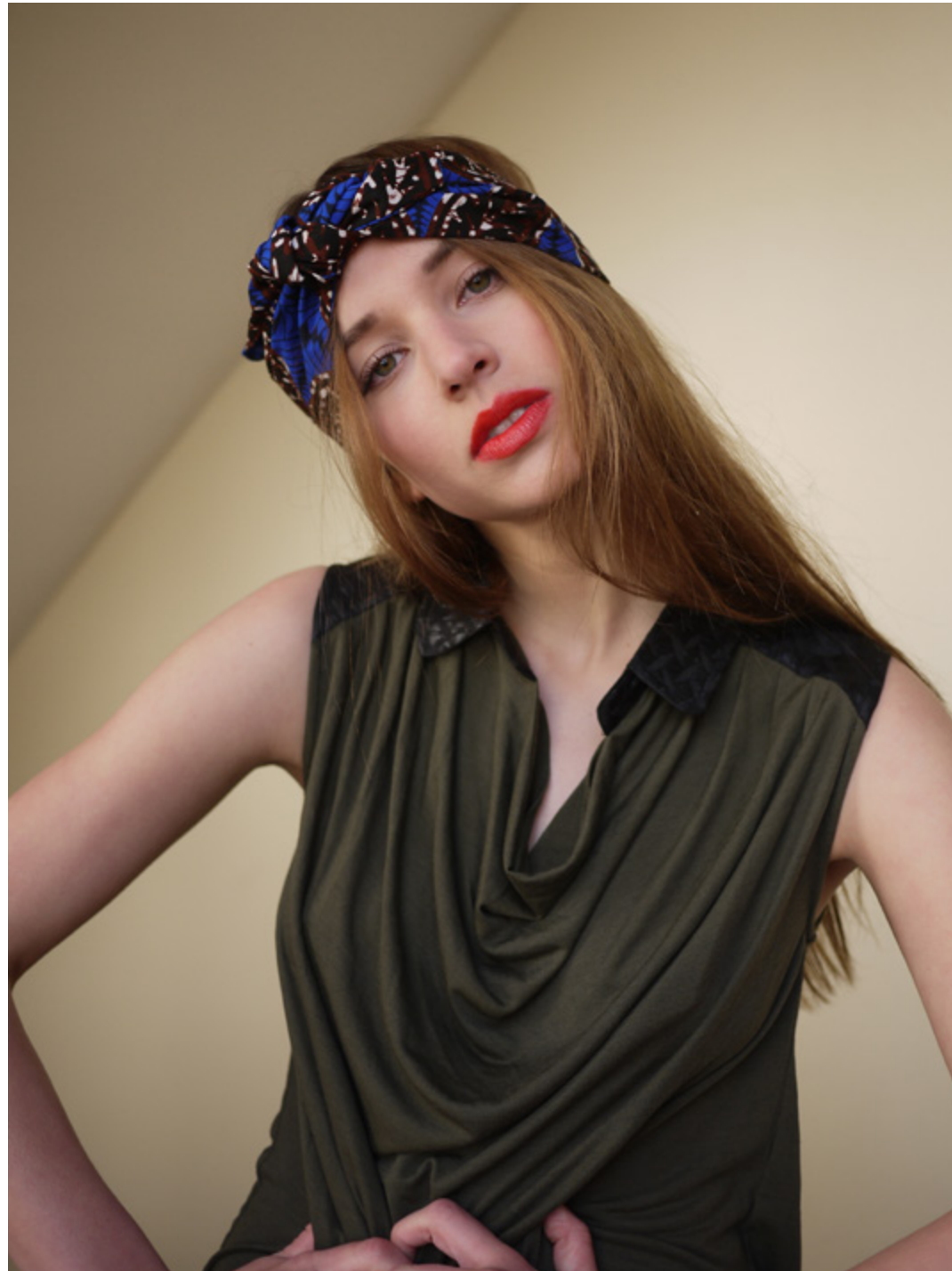
Headband Freya- Cotton Wax fabric - Handmade in France