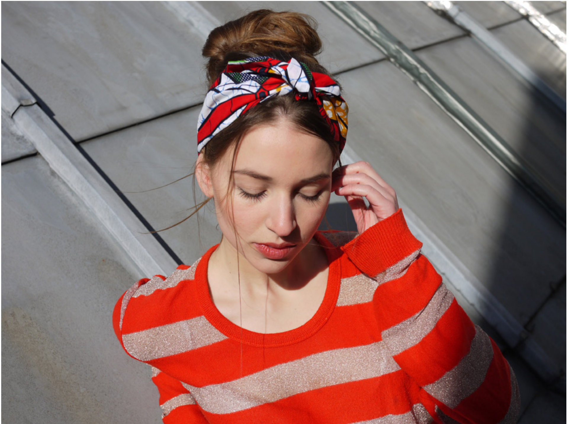
Headband Astra - Cotton Wax fabric - Handmade in France