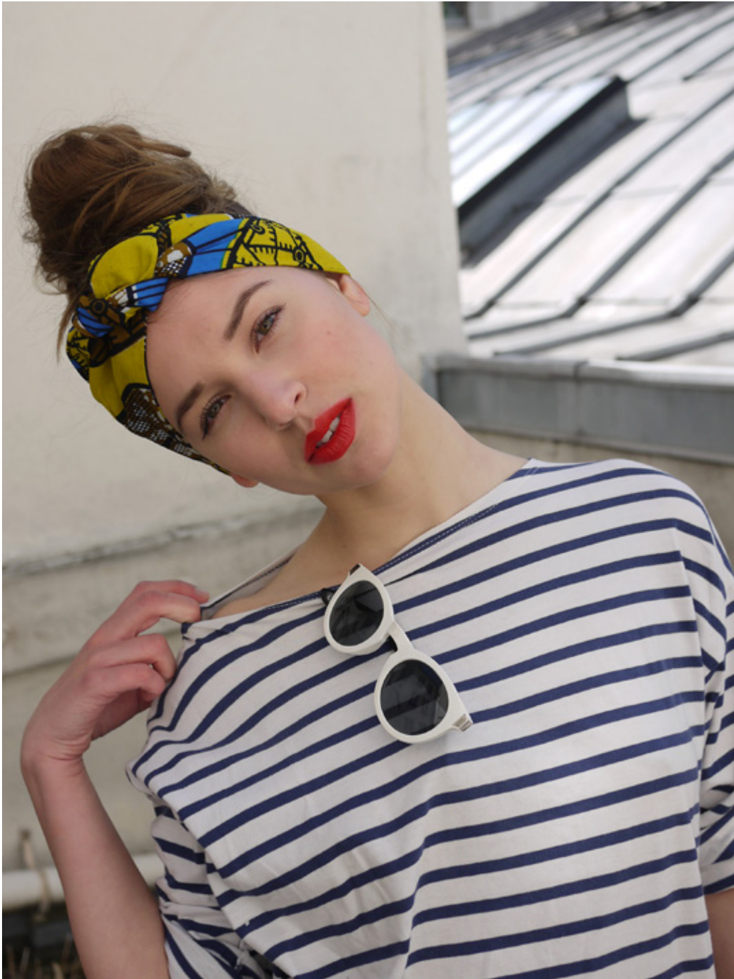
Headband Kimber - Cotton Wax fabric - Handmade in France