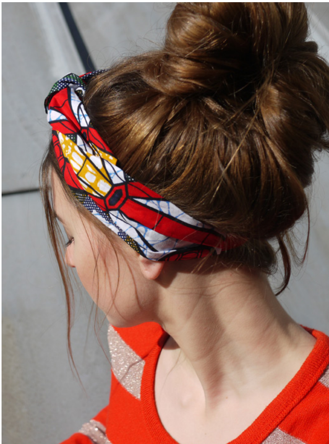
Headband Astra - Cotton Wax fabric - Handmade in France