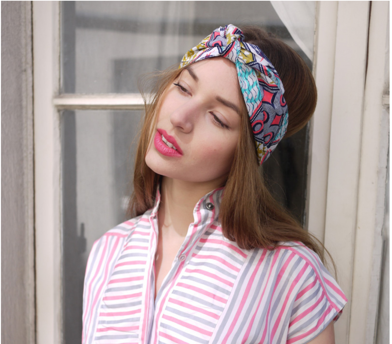
Headband Anise - Cotton Wax fabric - Handmade in France