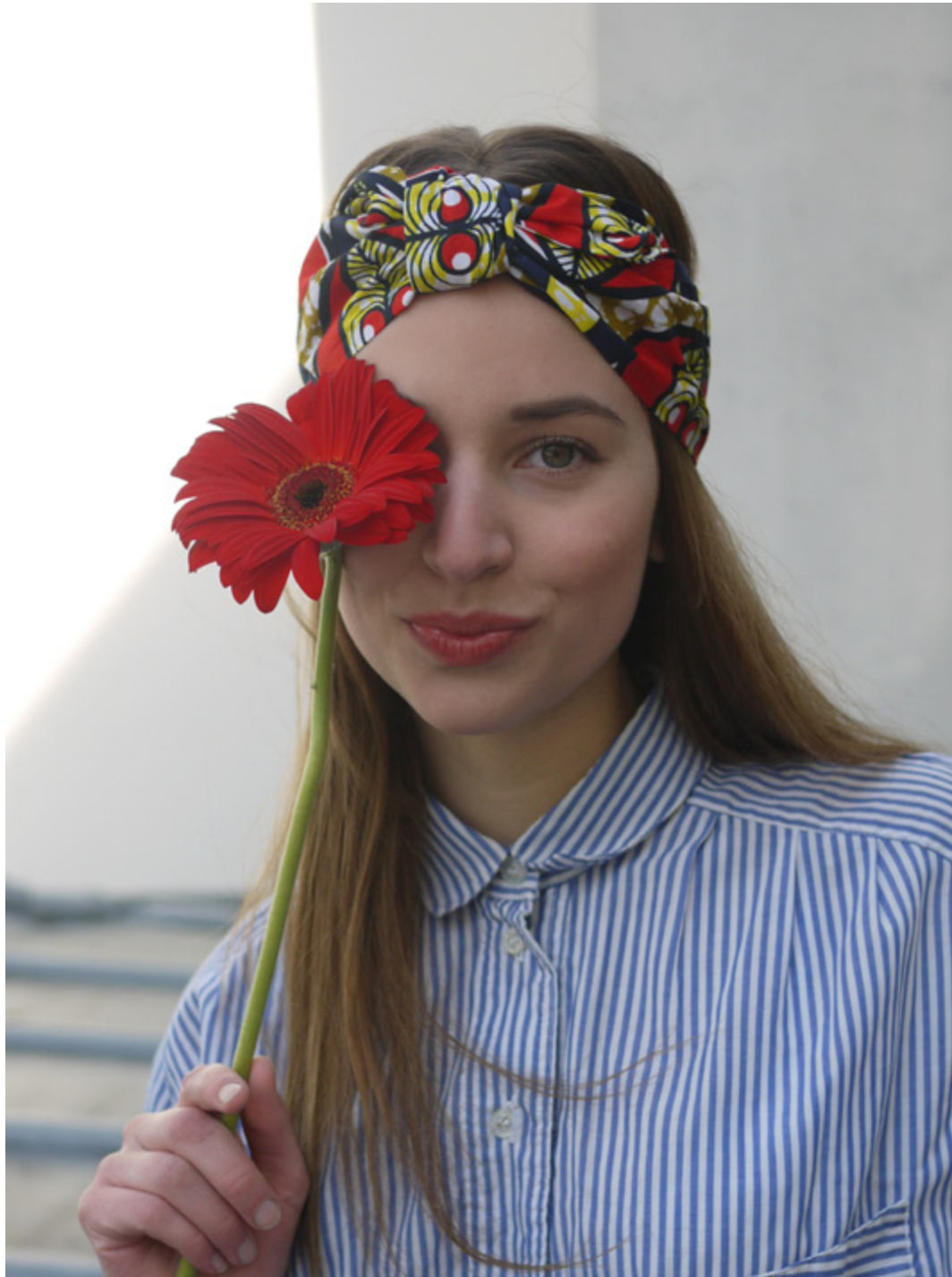
Headband Aggie - Cotton Wax fabric - Handmade in France