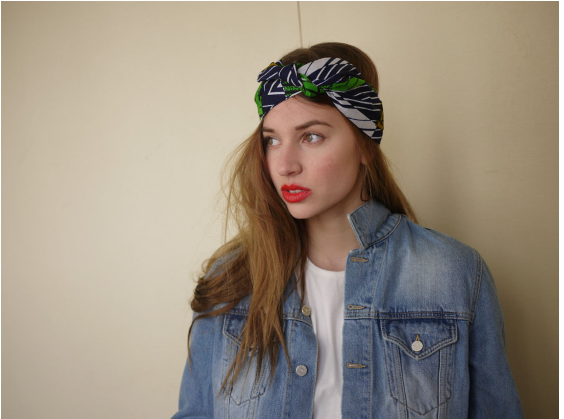
Headband Jacky - Cotton Wax fabric - Handmade in France