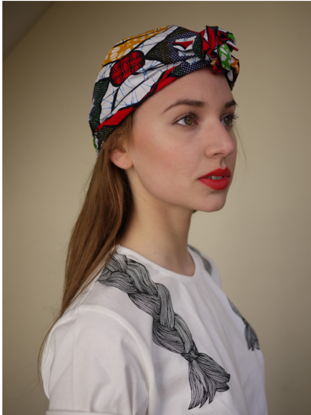
Turban Astra - Cotton Wax fabric - Handmade in France