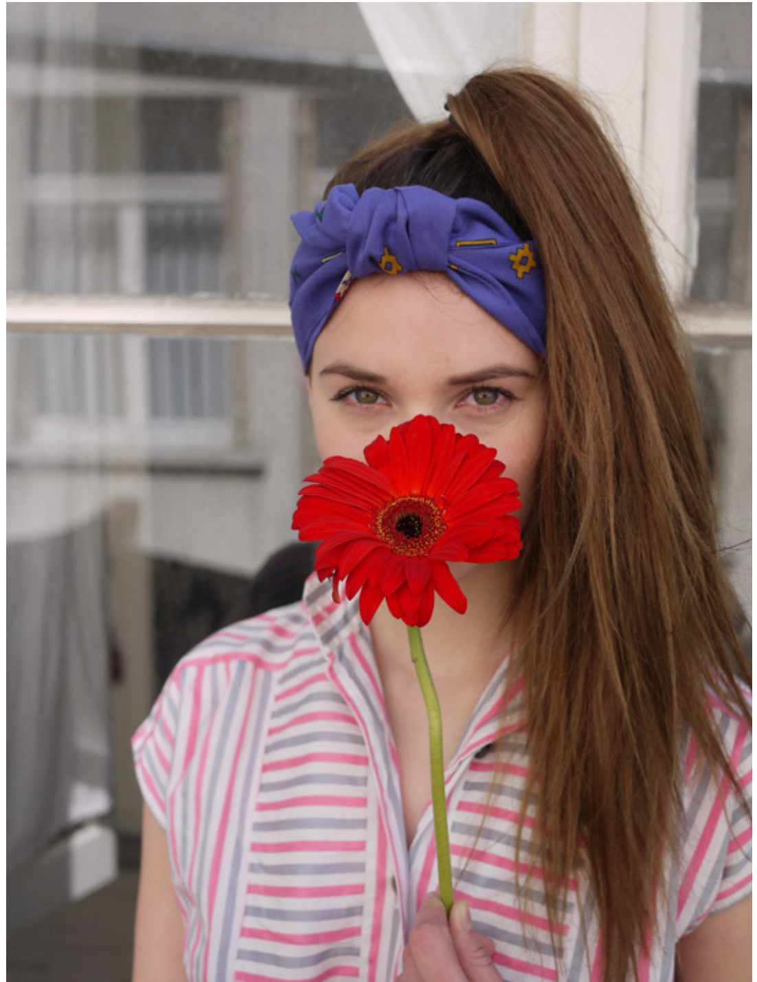
Headband Jane - Silky Viscos Vintage fabric - Handmade in France