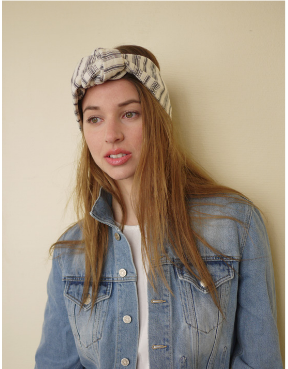
Headband Lucielle - Cotton Woven fabric - Handmade in France