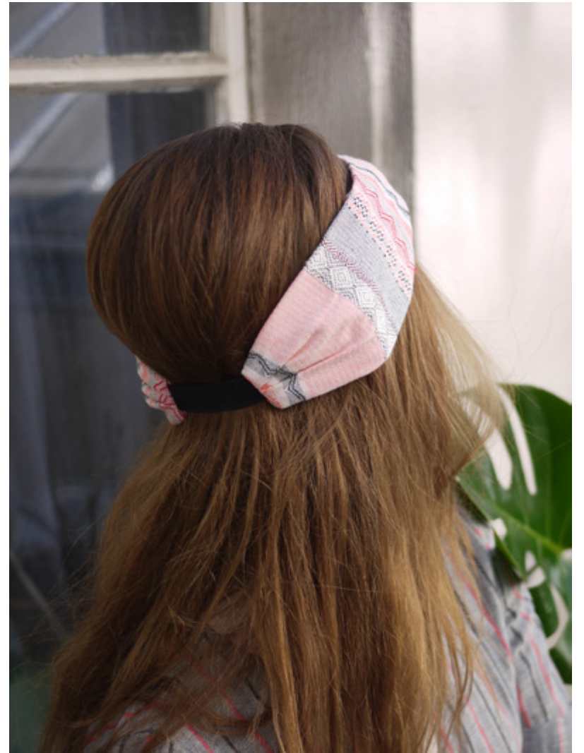
Headband Lala - Cotton Woven fabric - Handmade in France