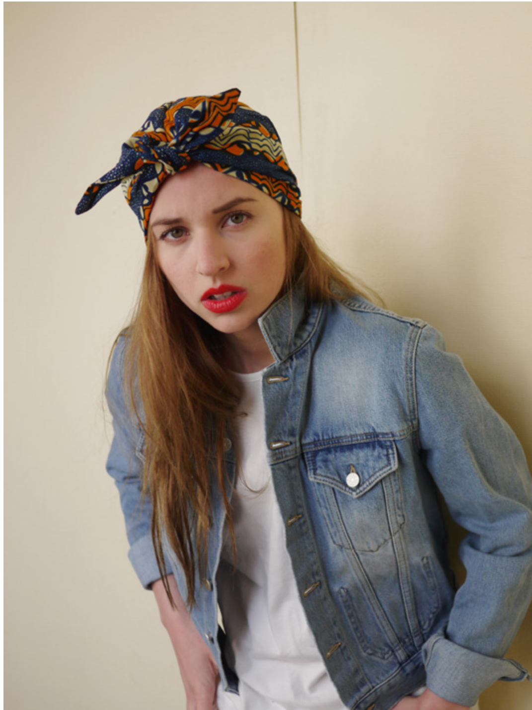
Turban Alea - Cotton Wax fabric - Handmade in France