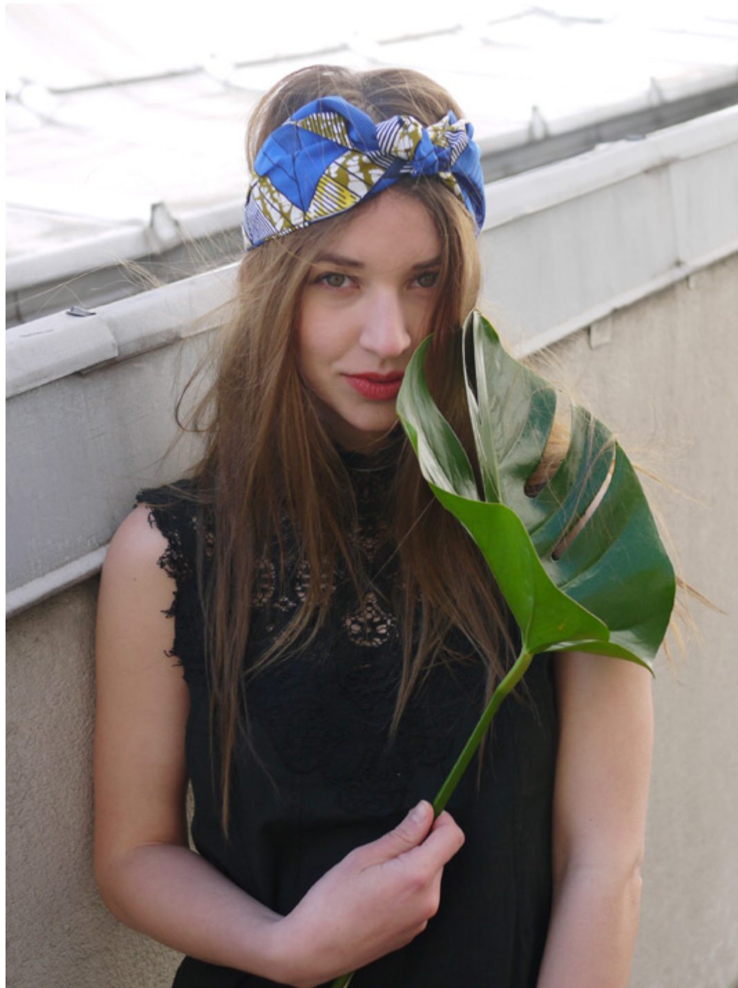
Headband Agantha - Cotton Wax fabric - Handmade in France