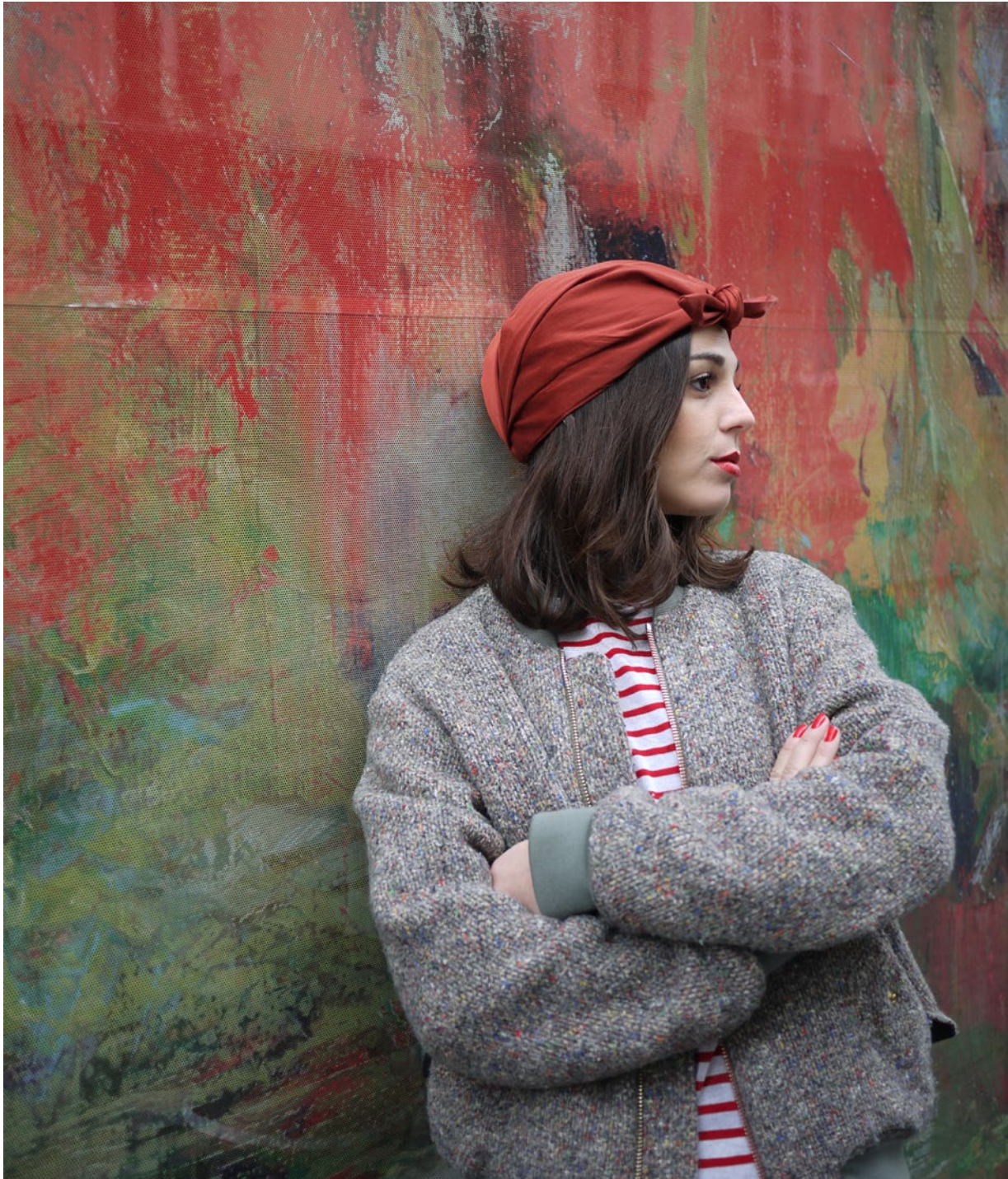
Turban Oria - Made in Paris