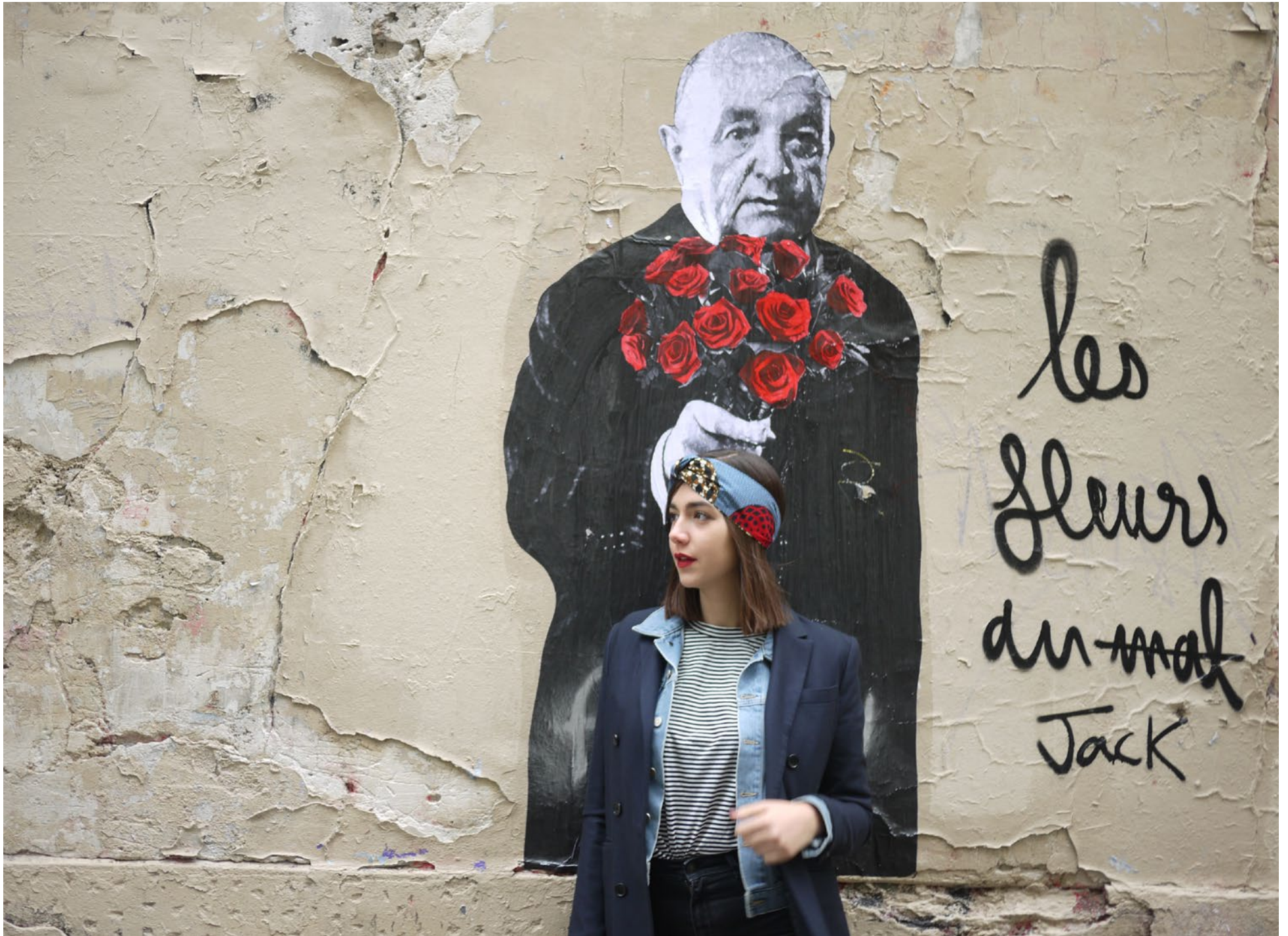
Headband Paloma- Made in Paris