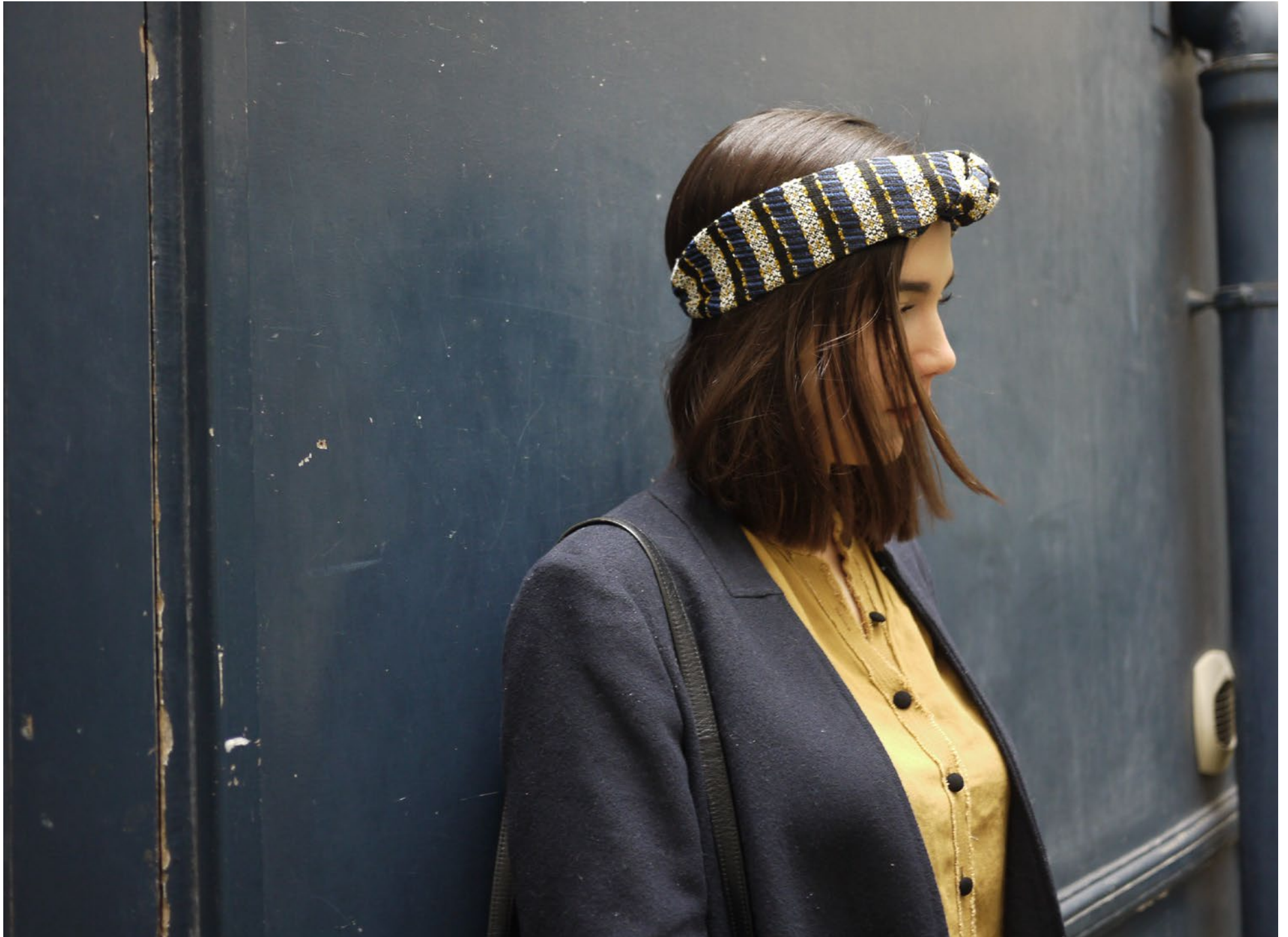
Headband Etney - Made in Paris