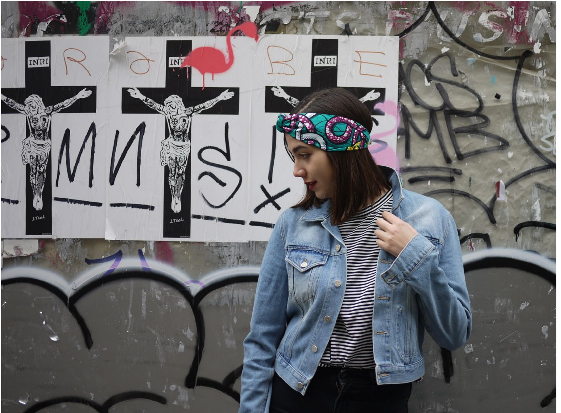
Headband Aina - Made in Paris