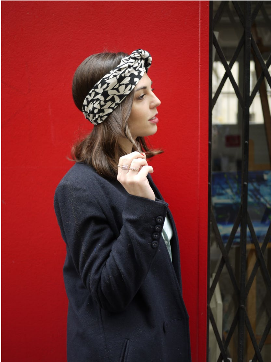
Headband Isla - Made in Paris