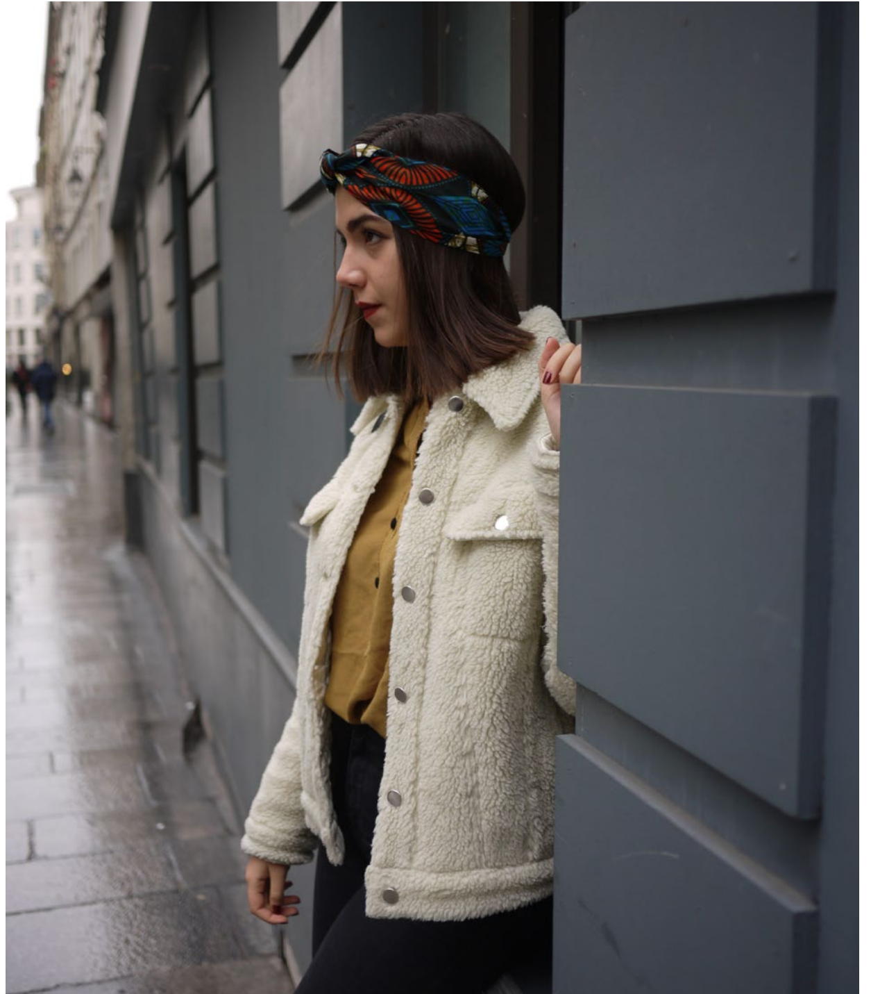
Headband Delma - Made in Paris