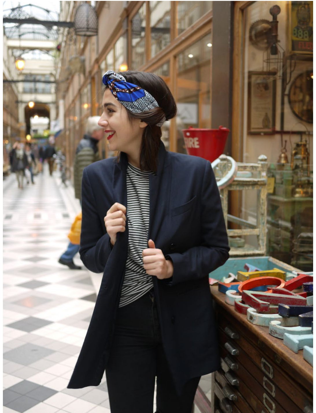
Headband Lottie - Made in Paris