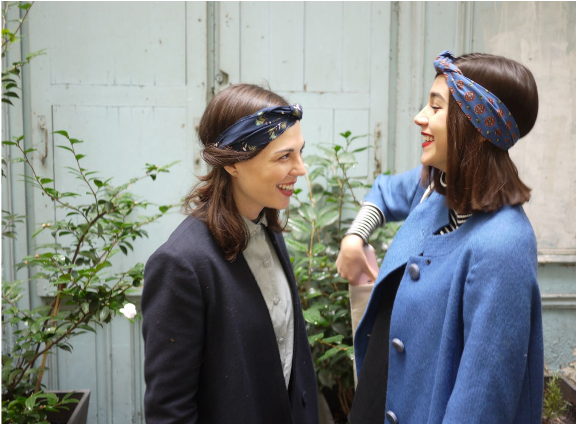
Headband Queenie - Lurex rib fabric - Handmade in France