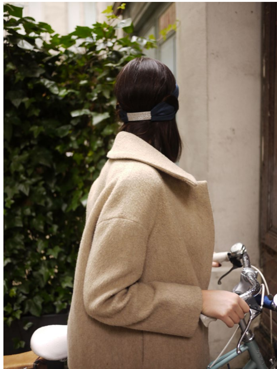
Headband Brona - Made in Paris