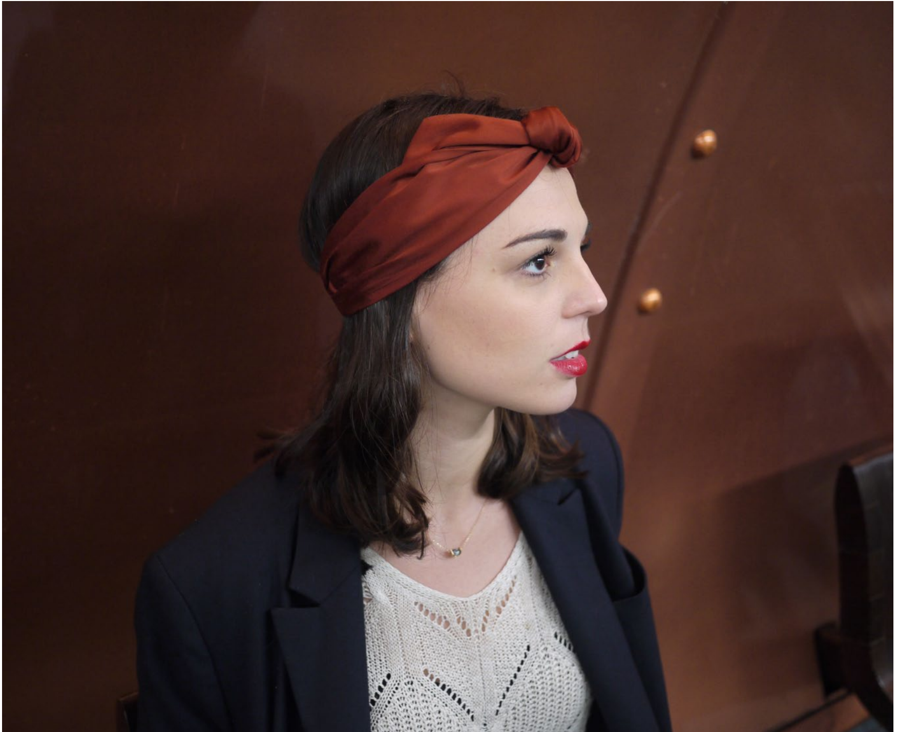
Headband Oria - Made in Paris