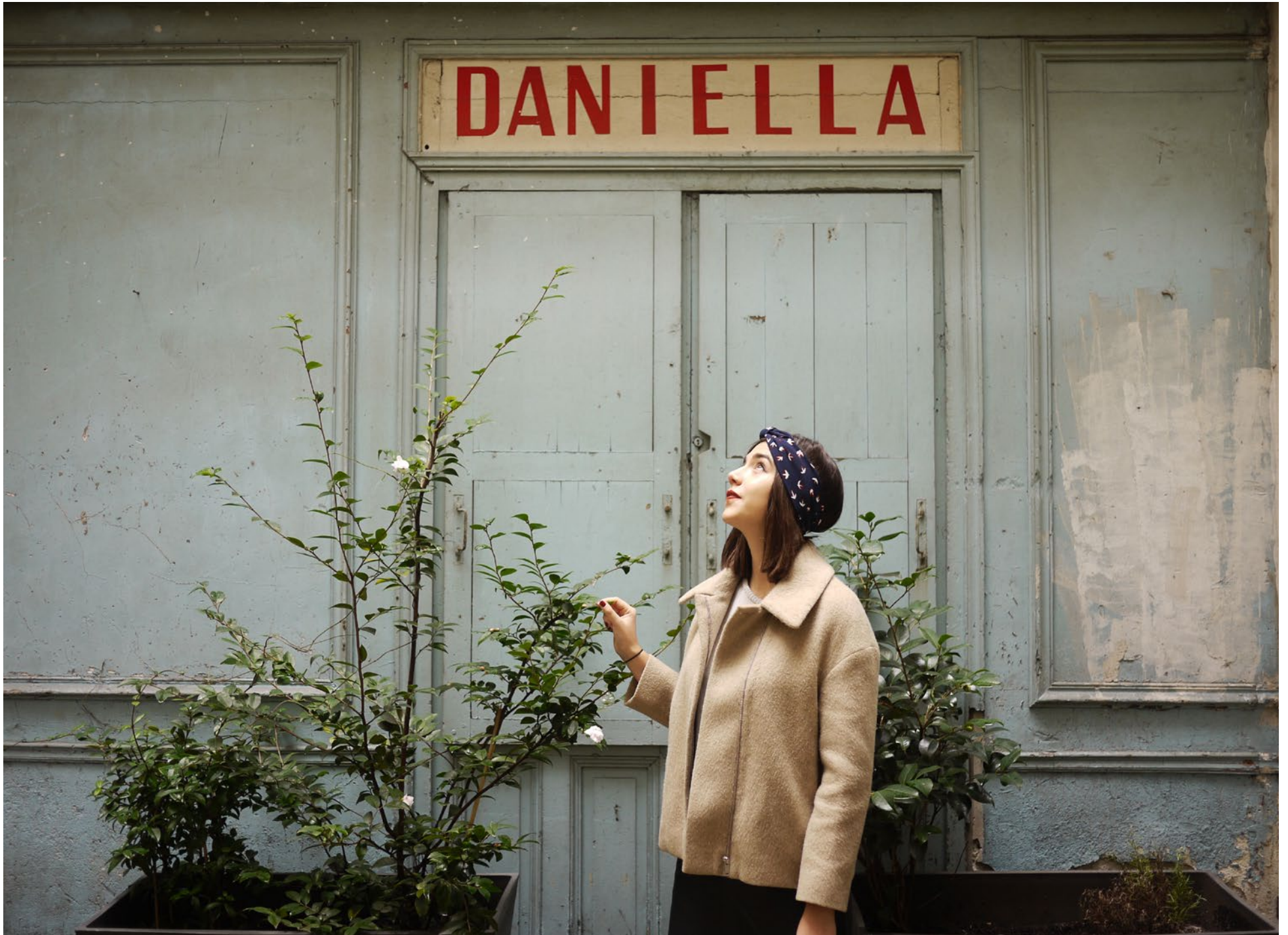
Headband Bindi - Made in Paris