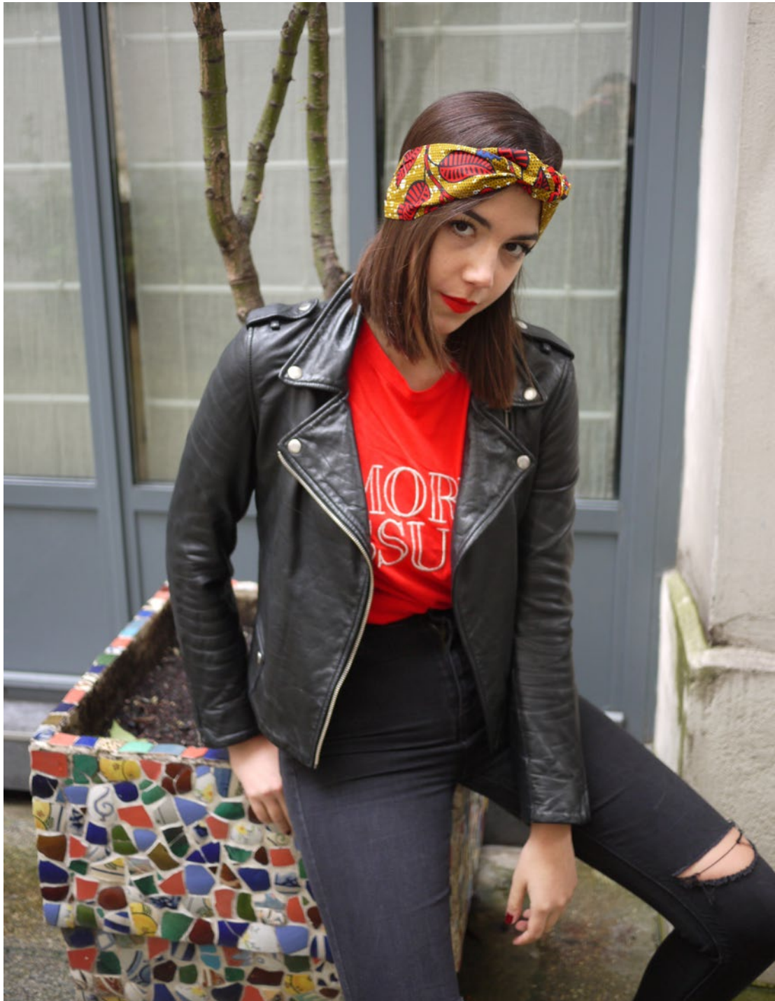
Headband Rana - Made in Paris