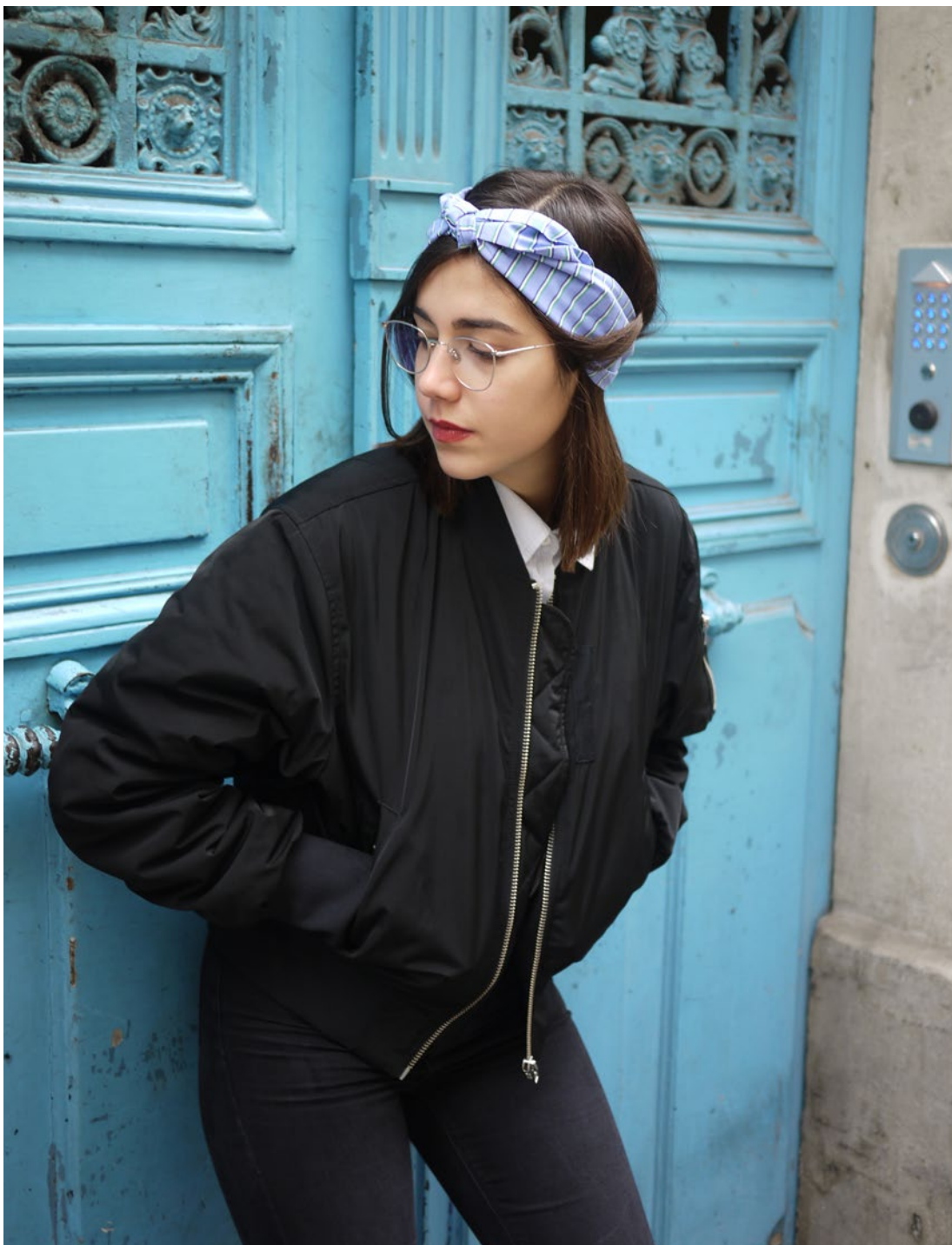
Headband Adelyn - Made in Paris