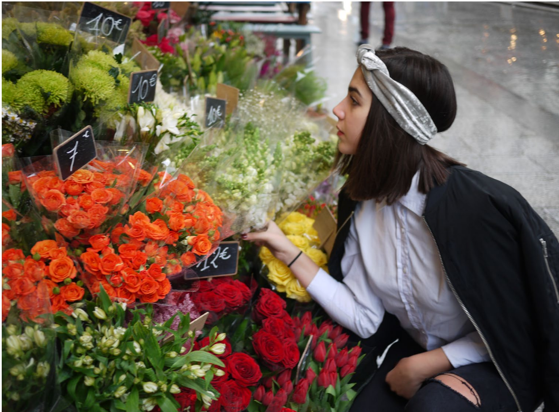
Headband Marther - Made in Paris