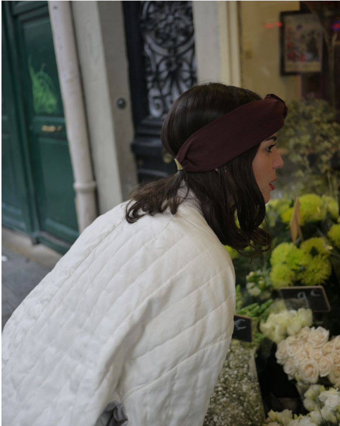
Headband Broka - Made in Paris