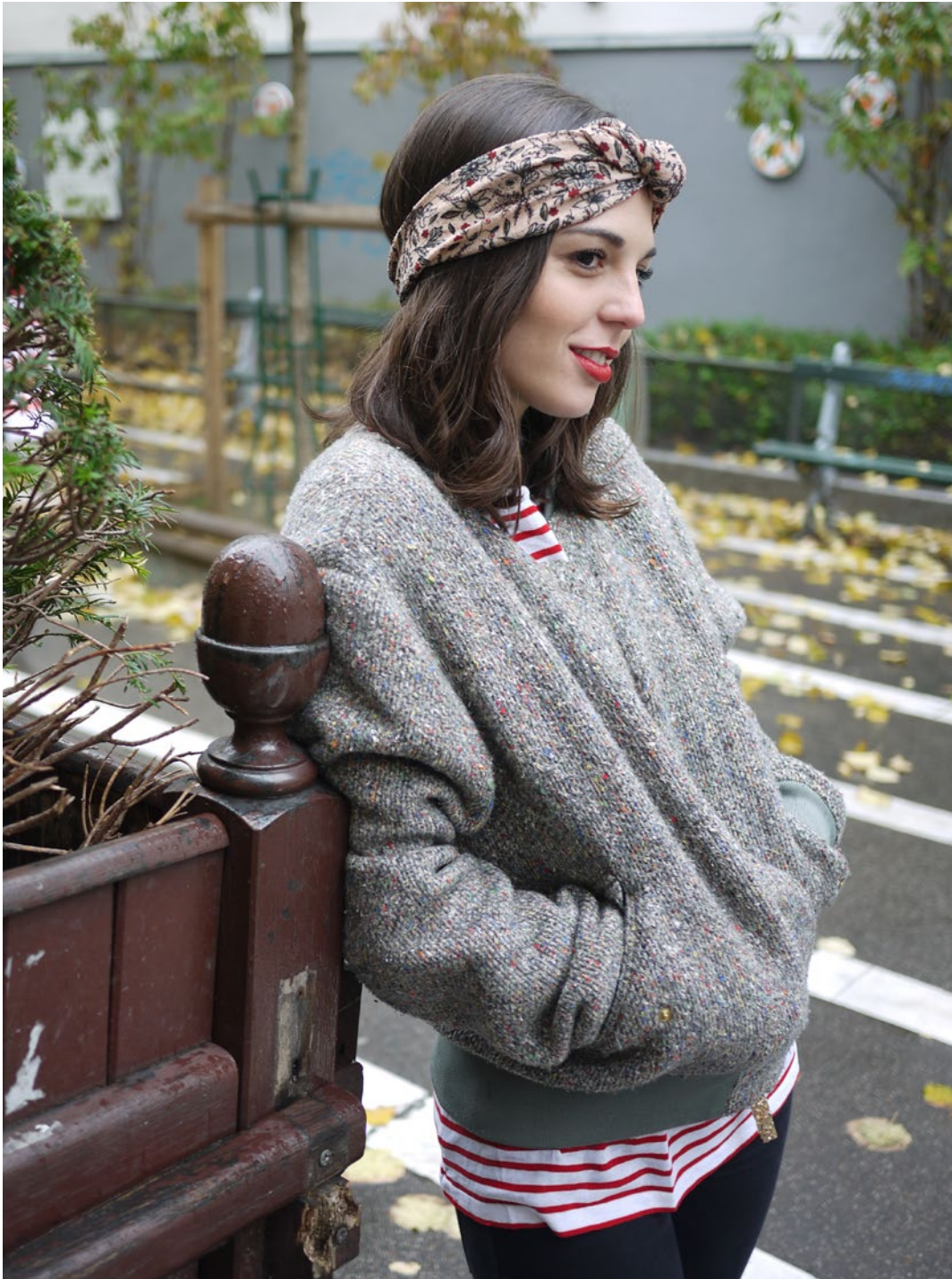
Headband Daisy - Made in Paris