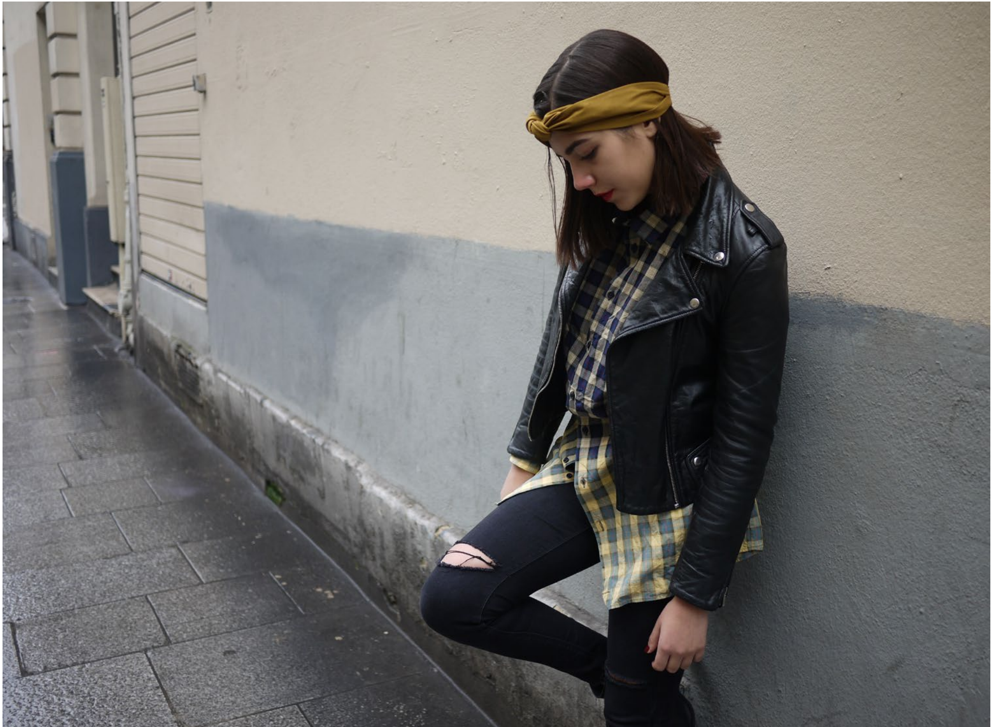
Headband Audrey - Made in Paris