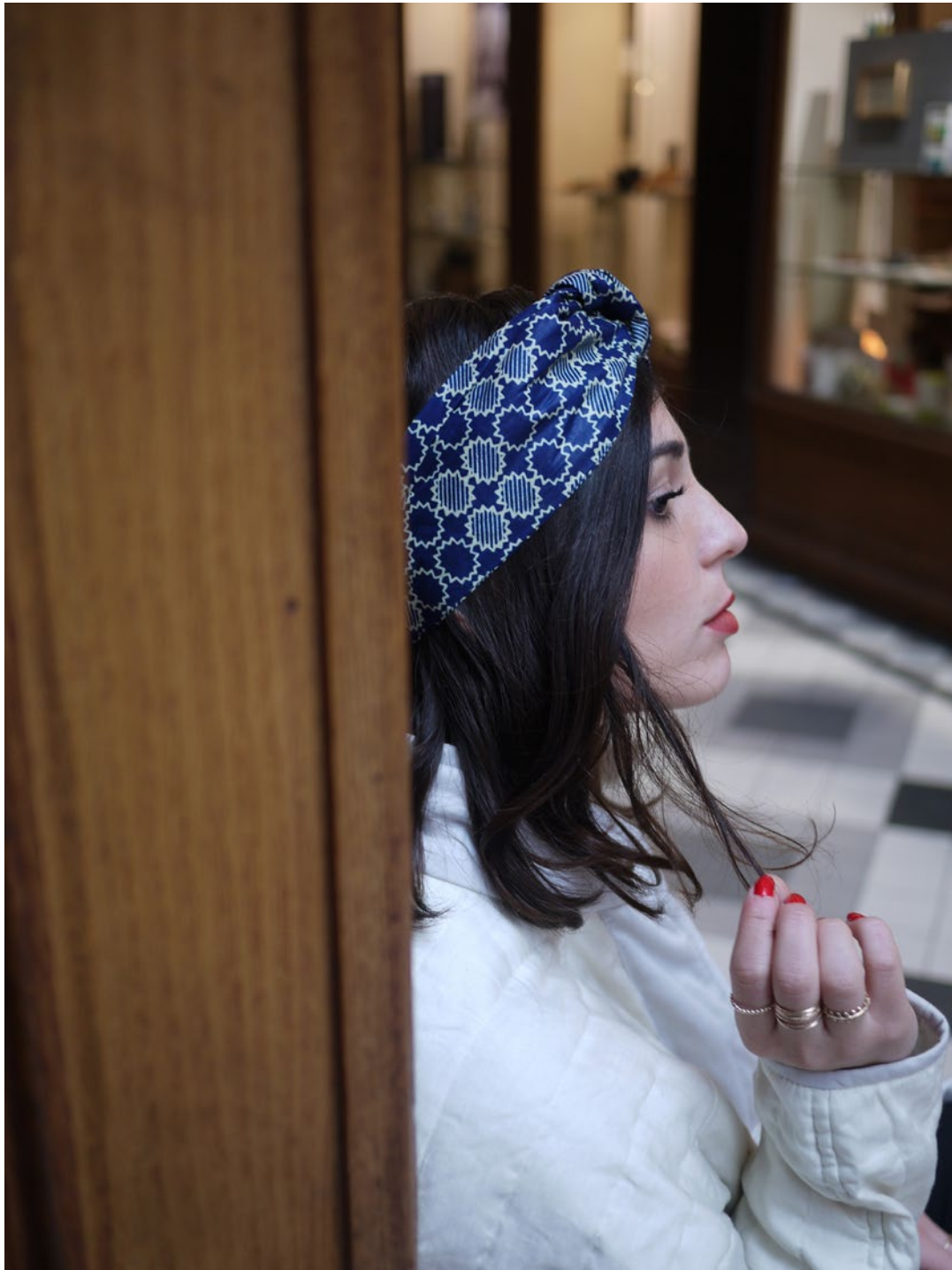
Headband Flor - Made in Paris