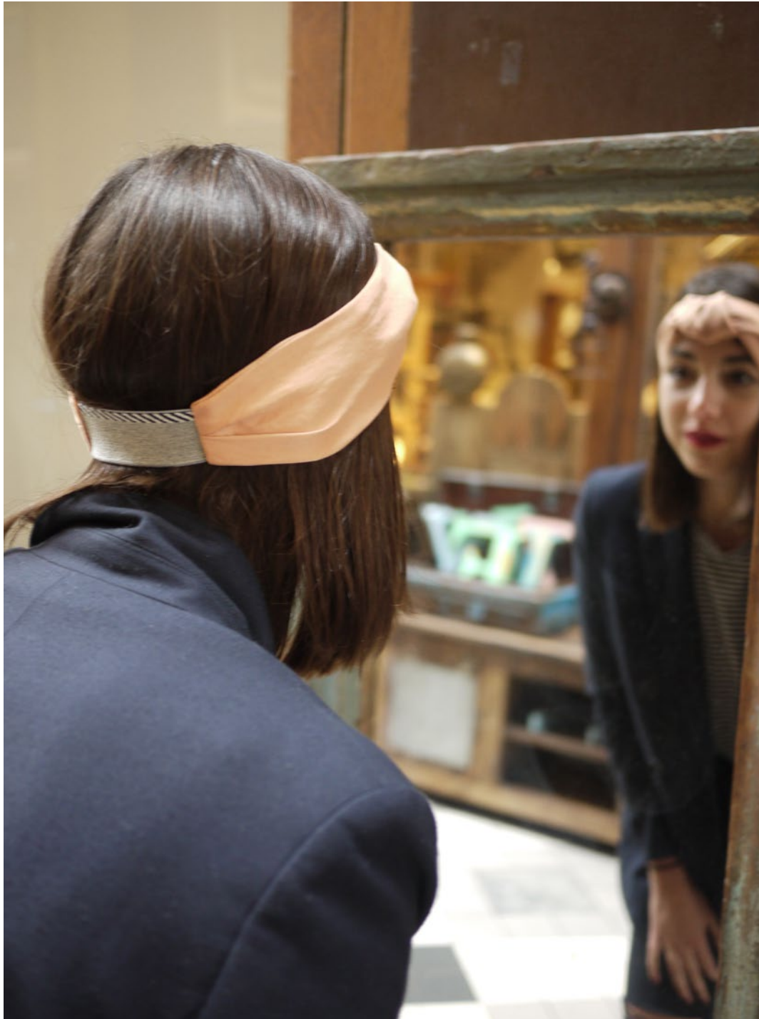
Headband Amanda - Made in Paris