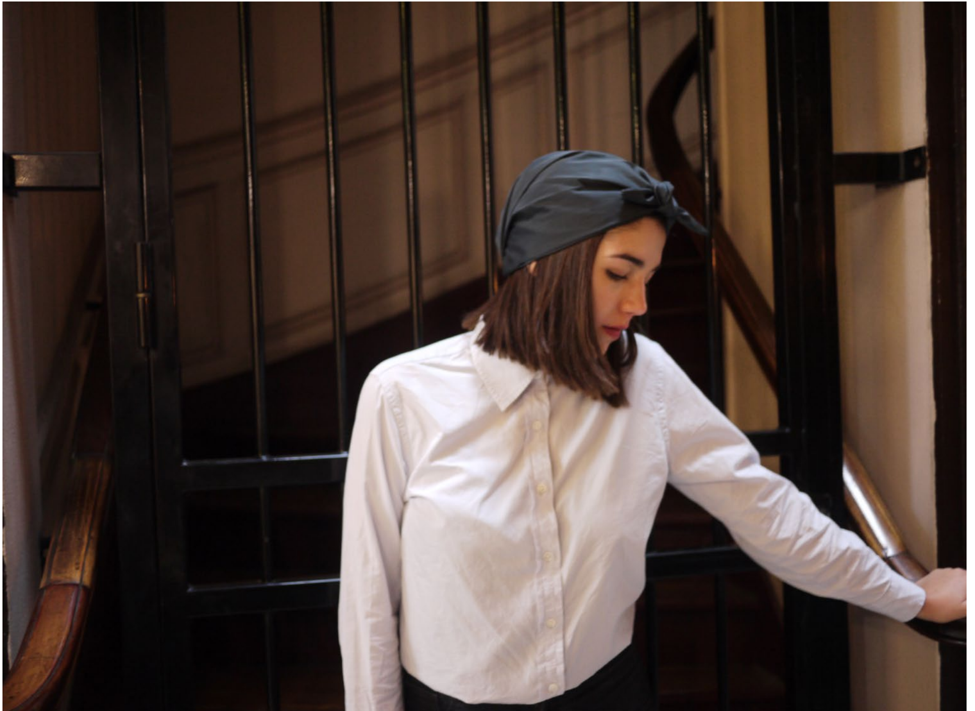
Turban Gavina - Made in Paris