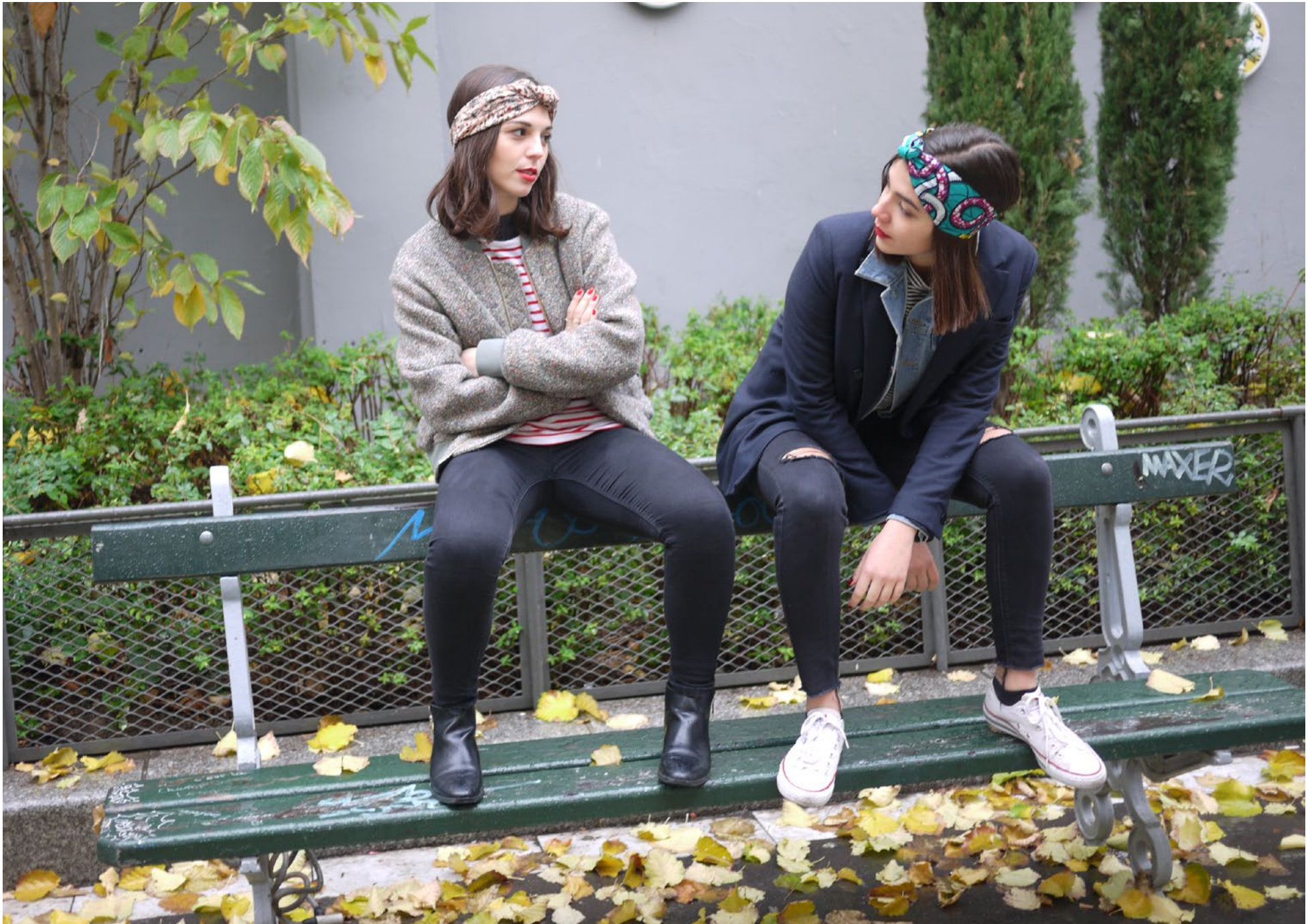
Headband Daisy - Headband Aina - Made in Paris