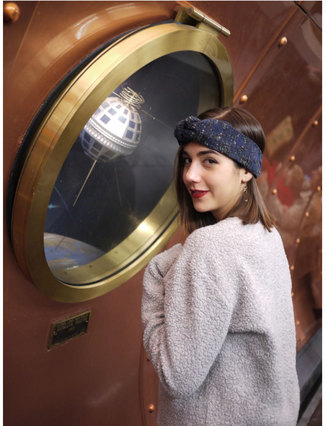
Headband Ewa - Made in Paris