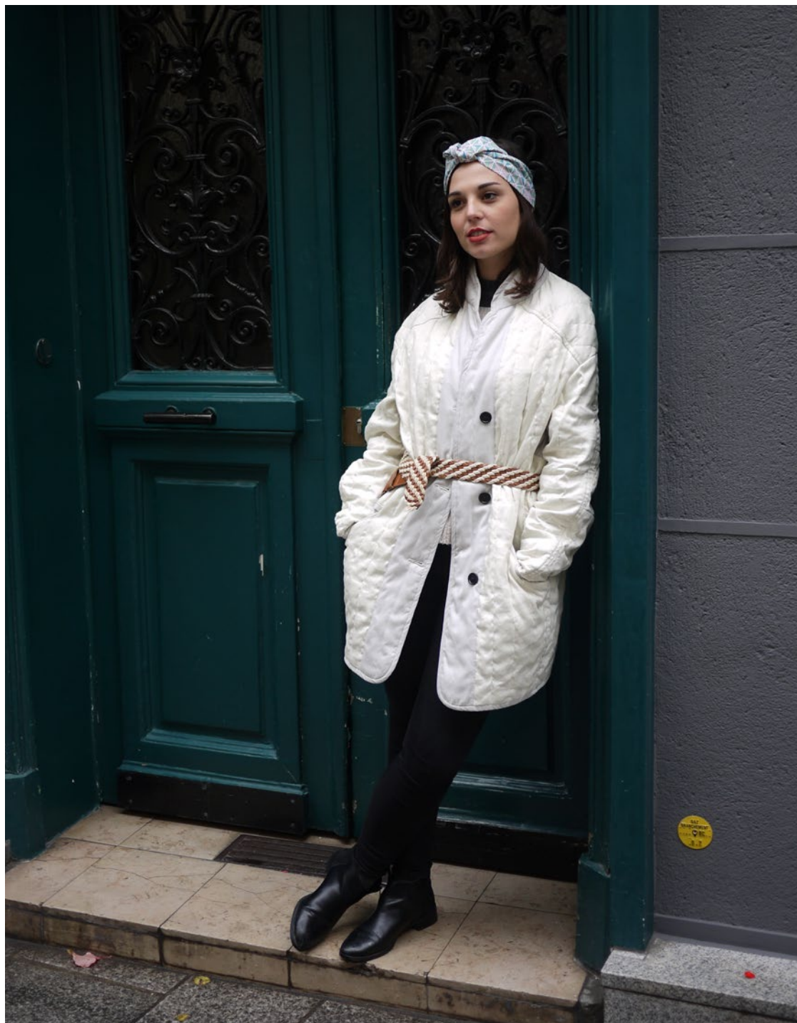
Headband Joelle - Made in Paris