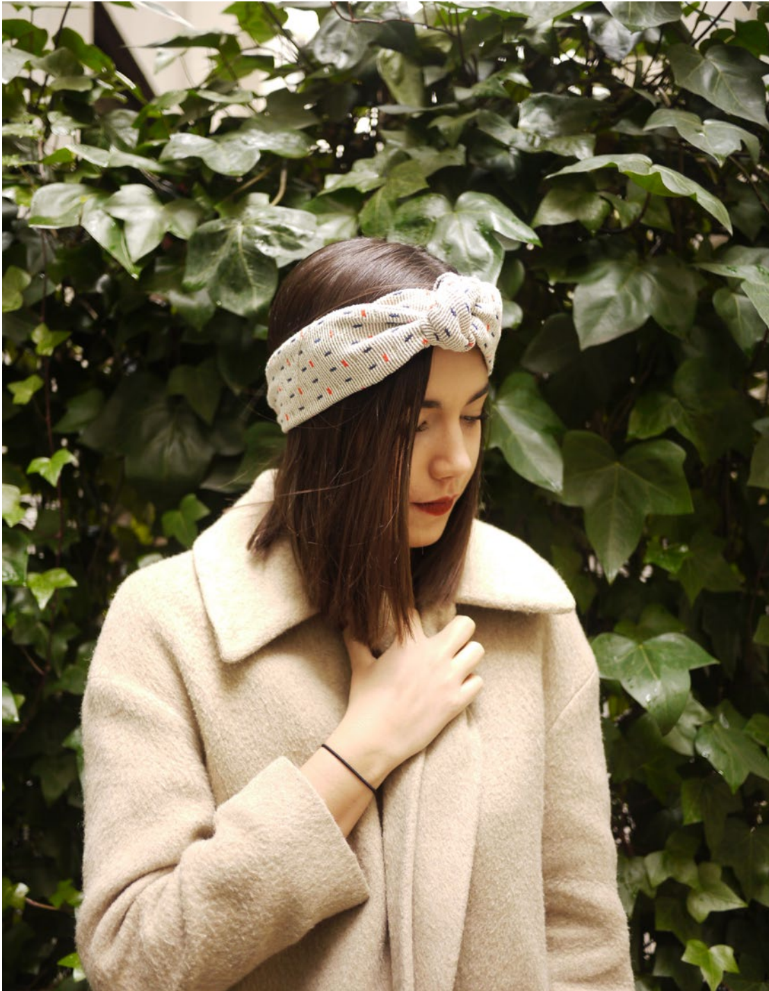
Headband Erlea - Made in Paris