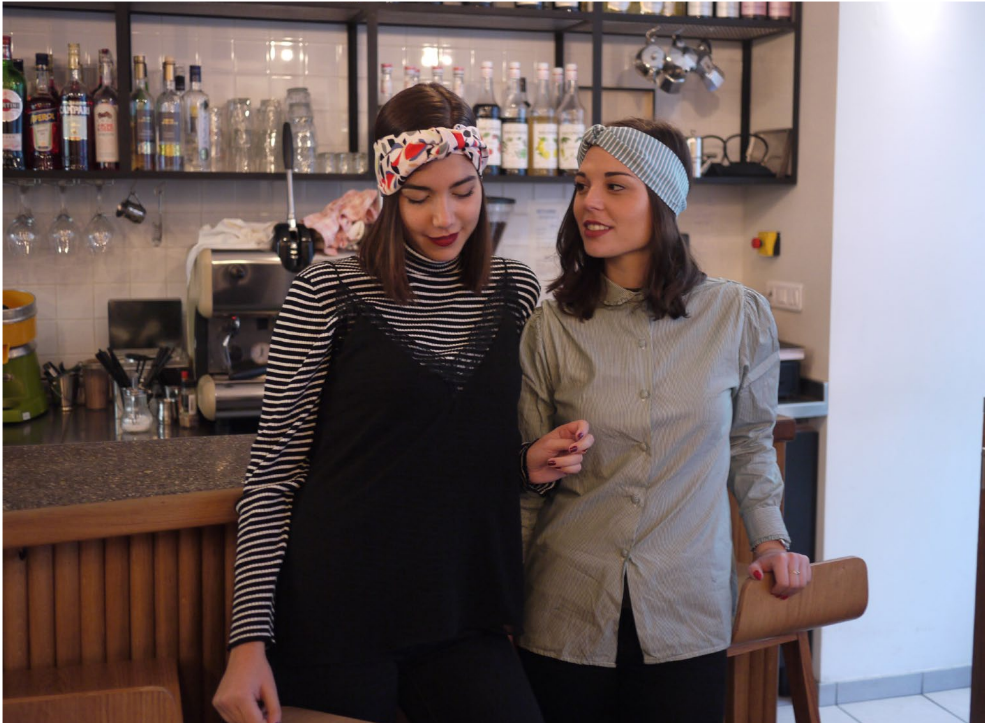
Headband Delwen - Headband Clio - Made in Paris