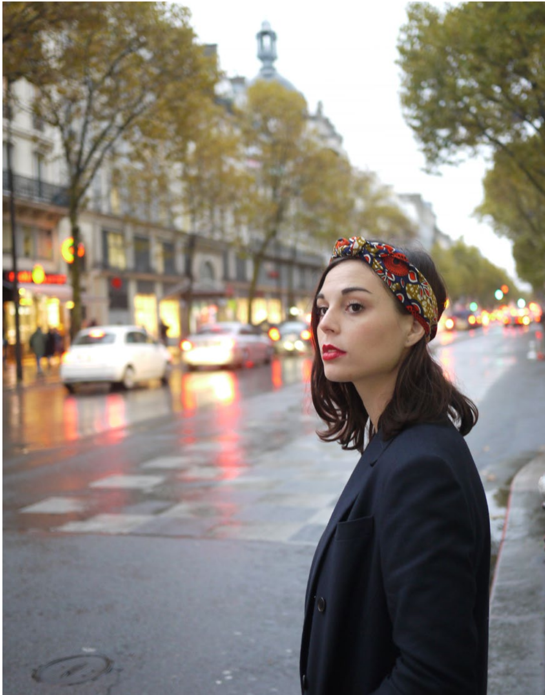
Turban Ushia - Made in Paris