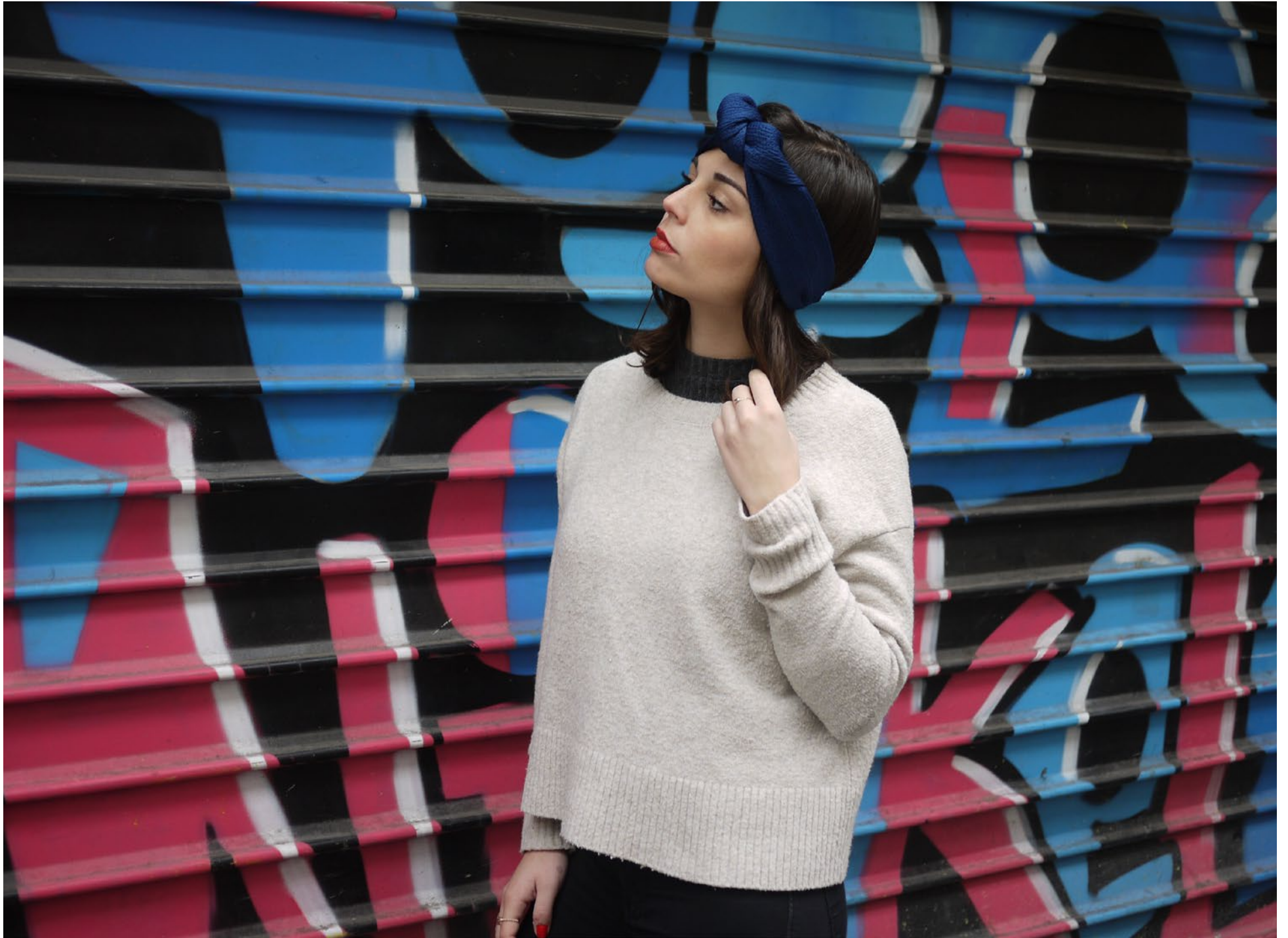
Headband Odelle - Made in Paris