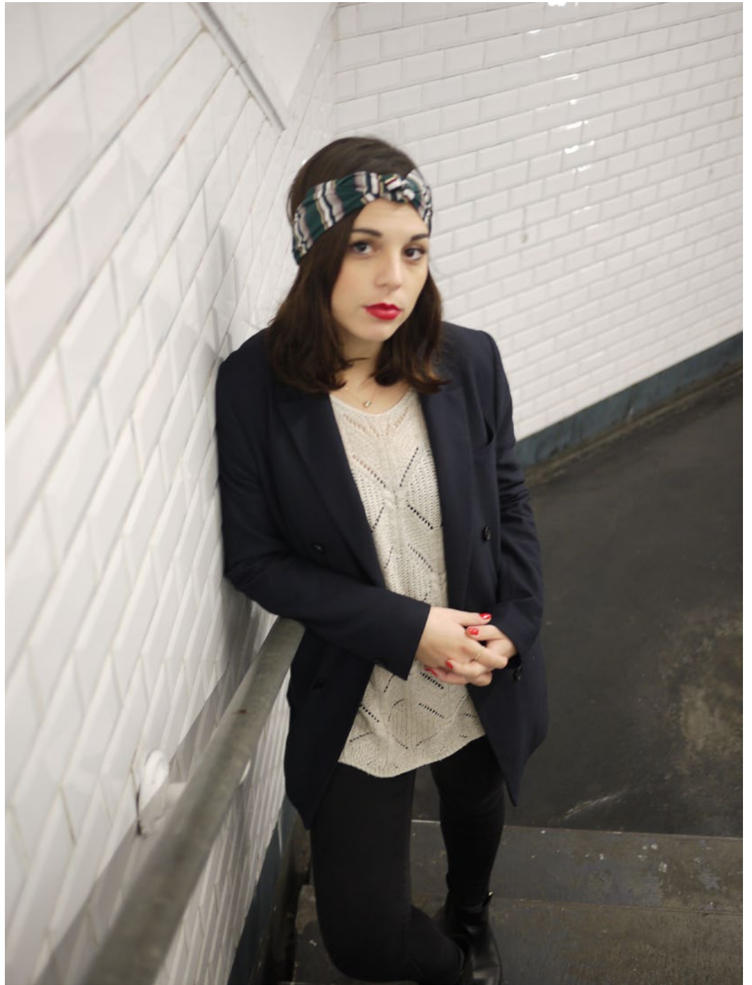
Headband Galice - Made in Paris