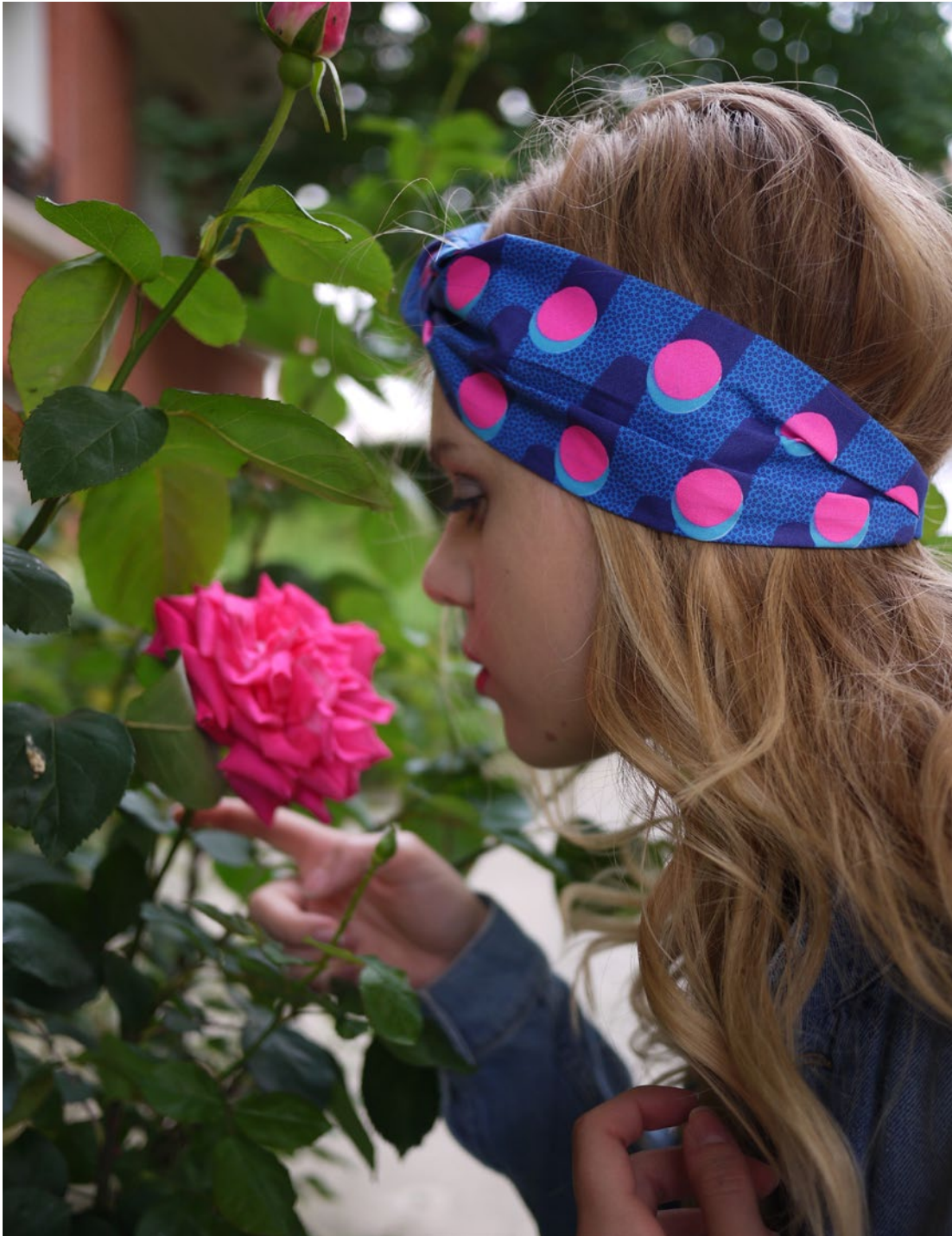
Headband Cece - Made in Paris