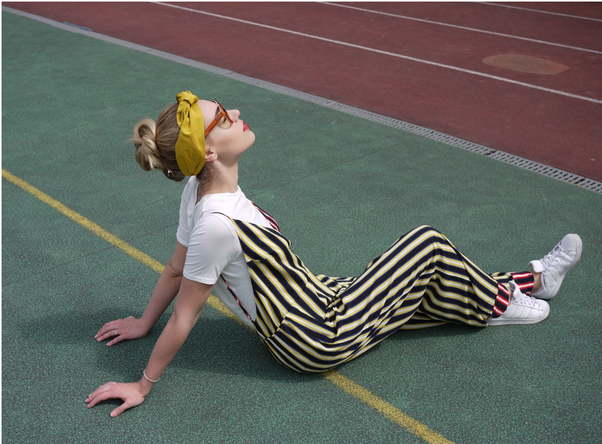
HeadbandYanka - Made in Paris