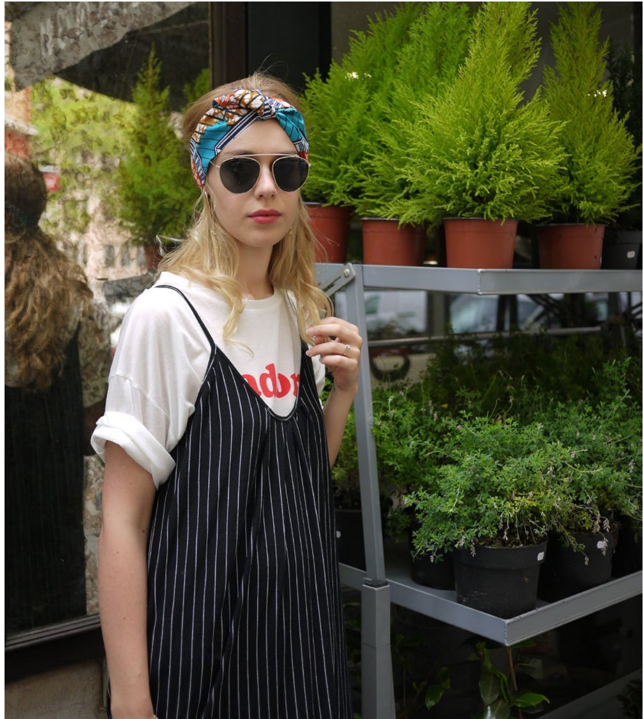
Headband Frankie- Made in Paris