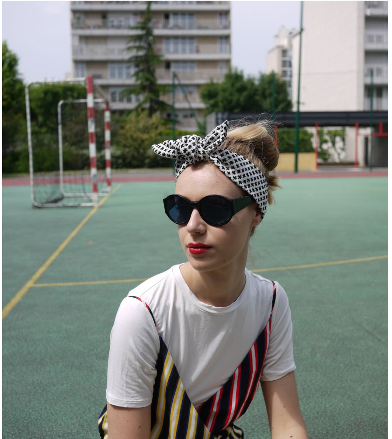
Headband Christy - Made in Paris