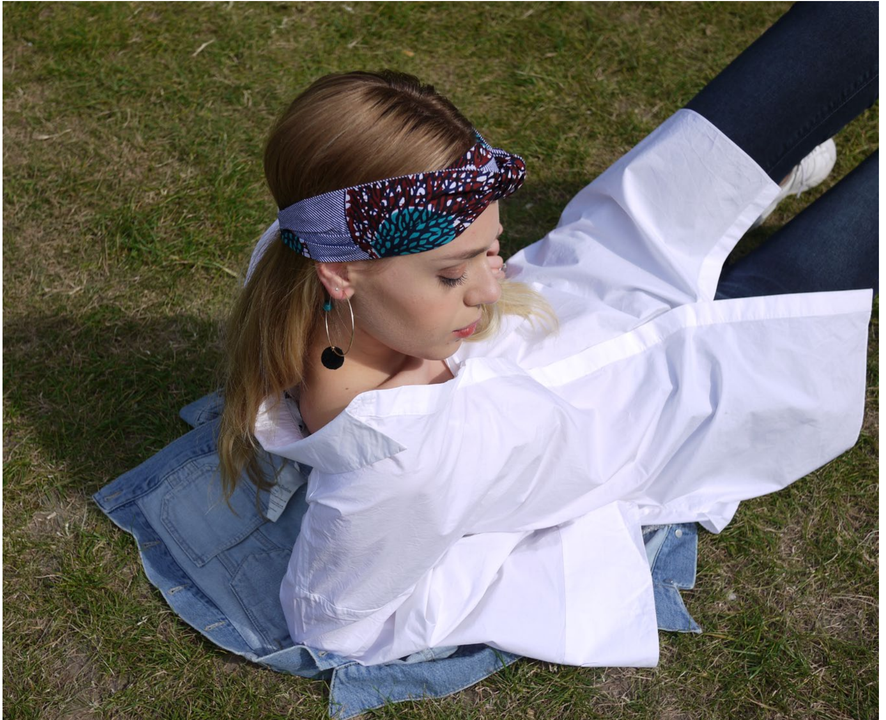
Headband Timia - Made in Paris