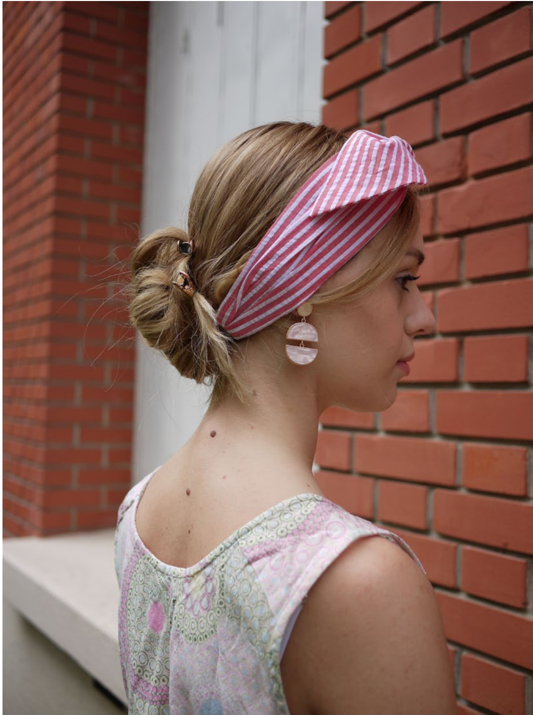
Headband Randa - Made in Paris