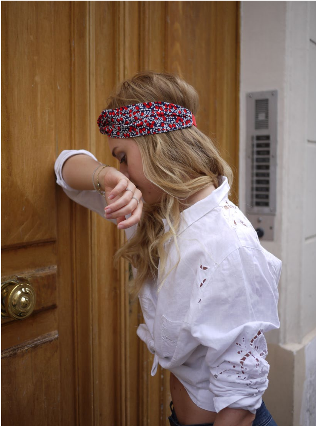
Headband Osha - Made in Paris