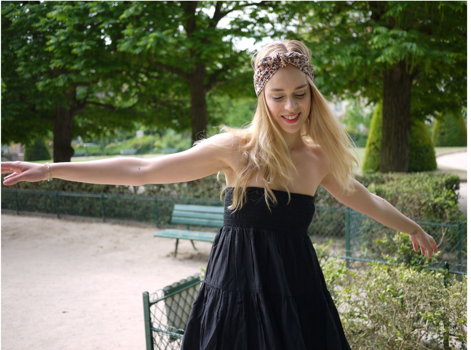
Turban Daisy - Made in Paris