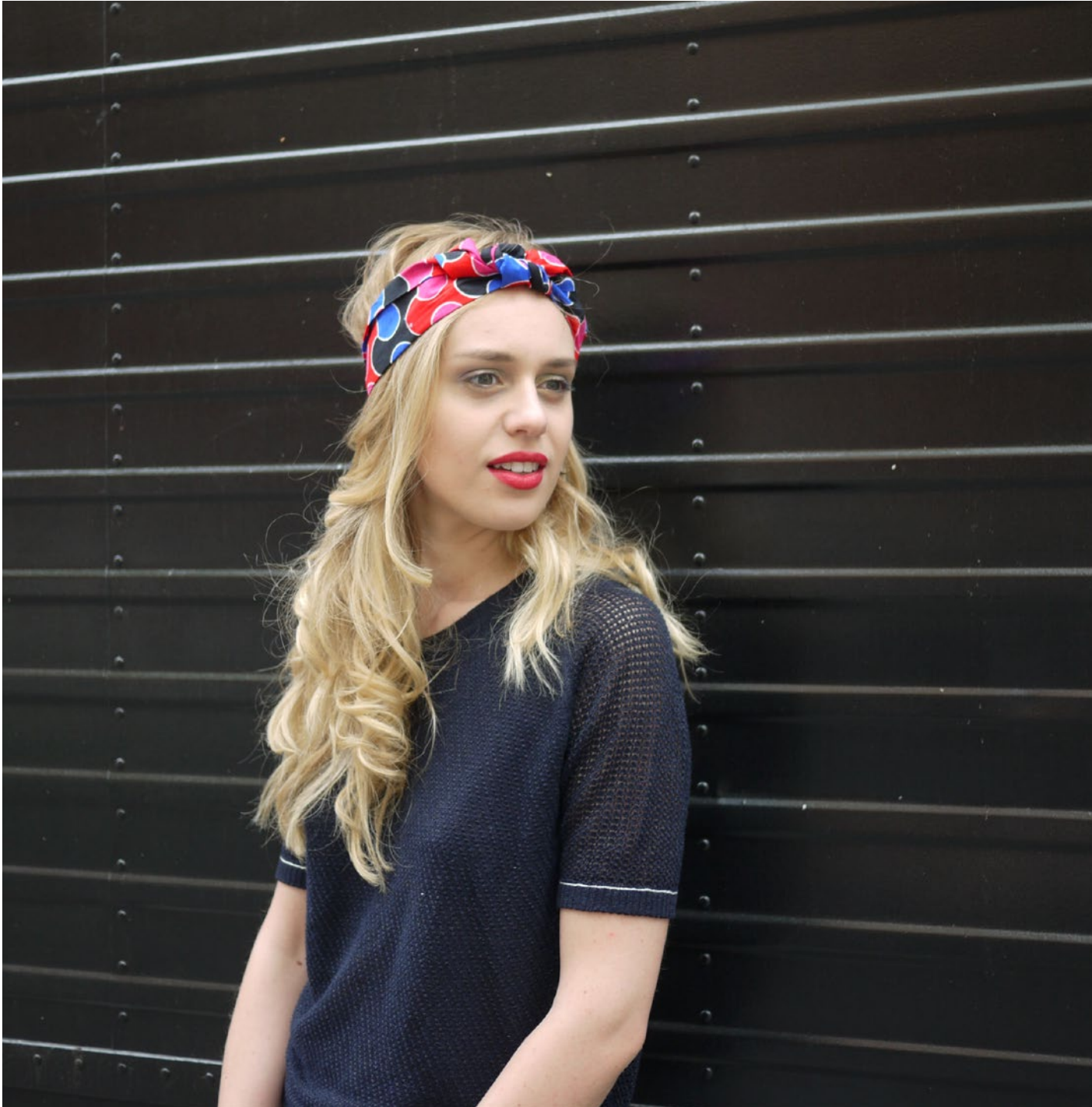
Headband Margo - Made in Paris