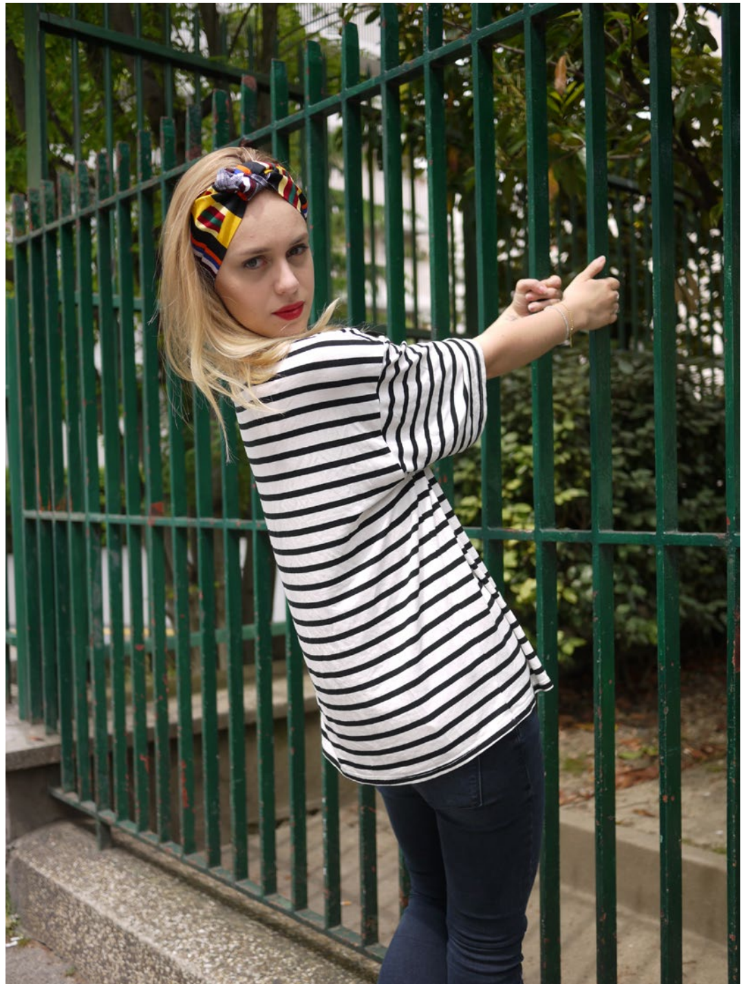
Headband Sashi - Made in Paris