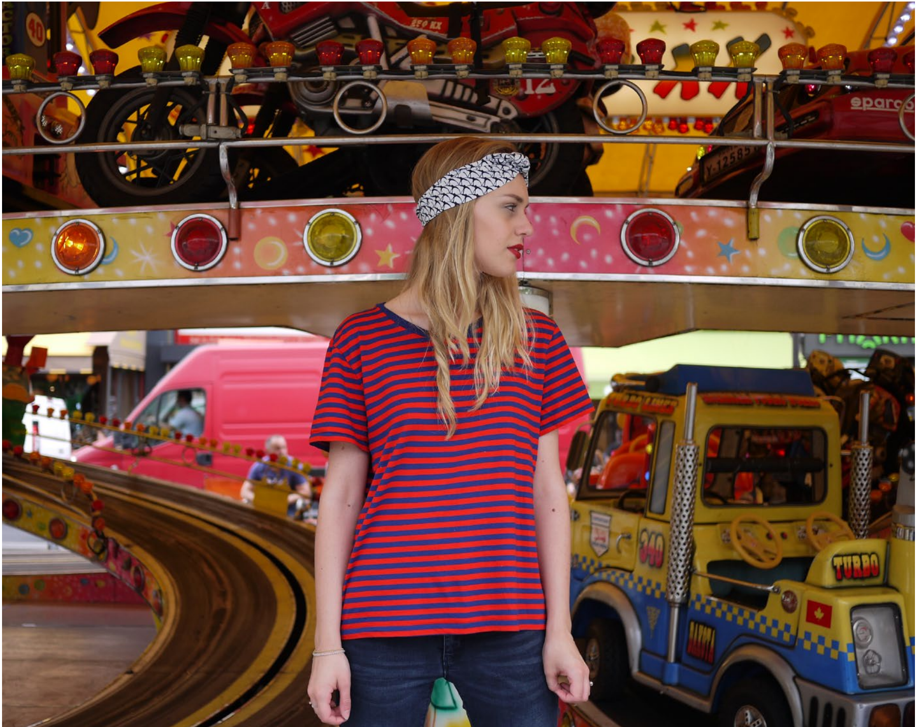
Headband Rowan - Handmade in France