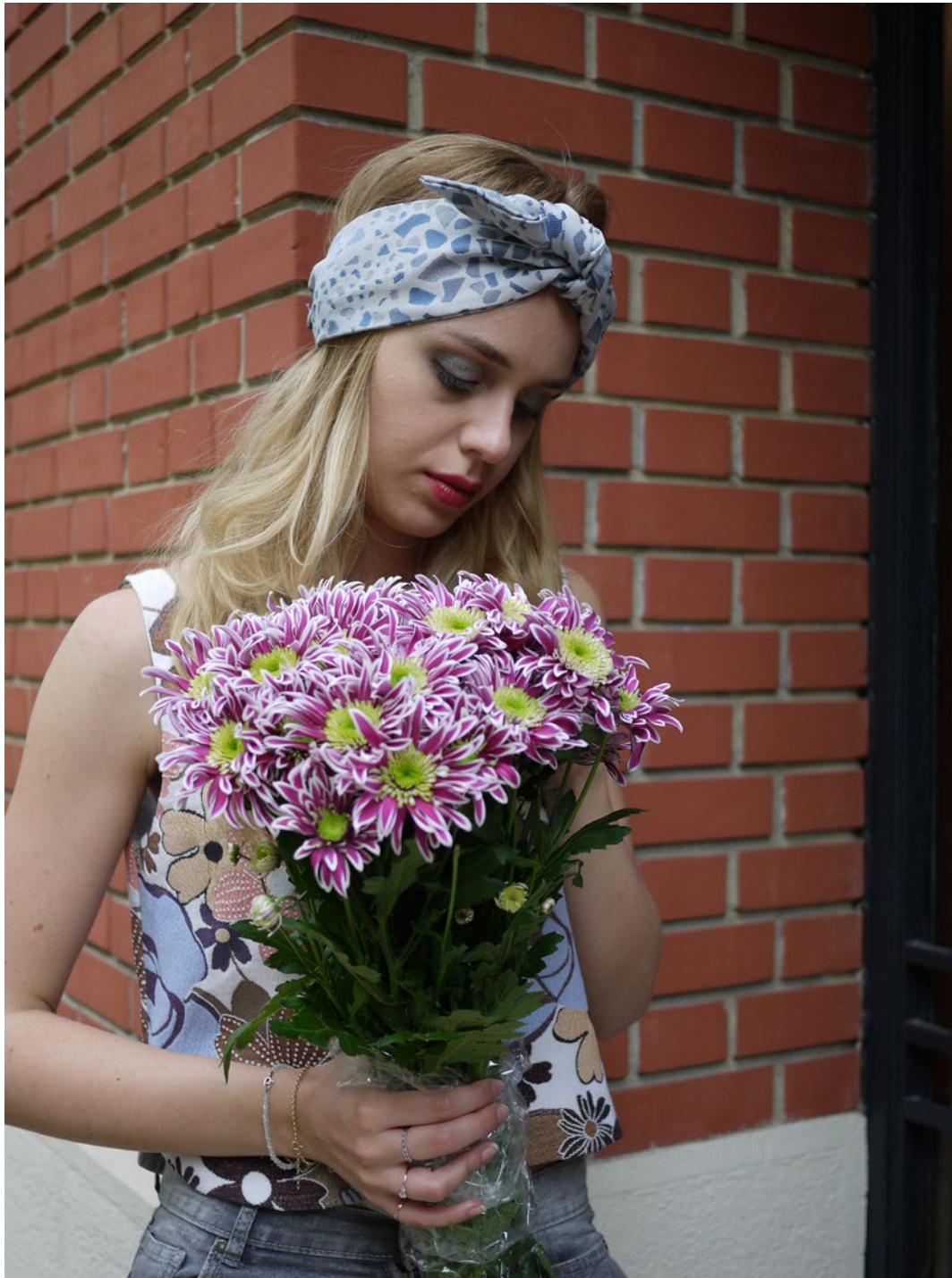
Headband Marcia - Made in Paris