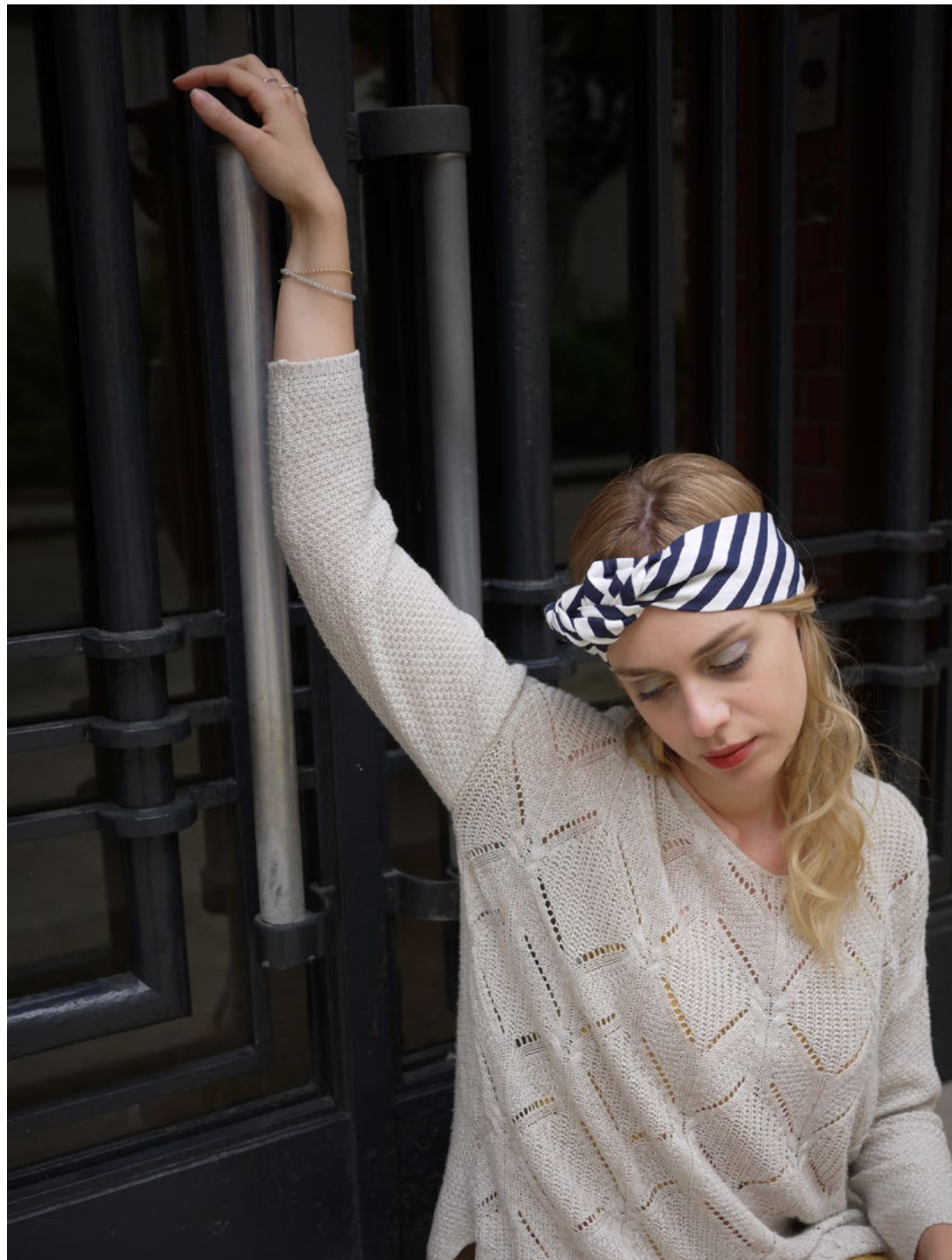
Headband Candy- Made in Paris