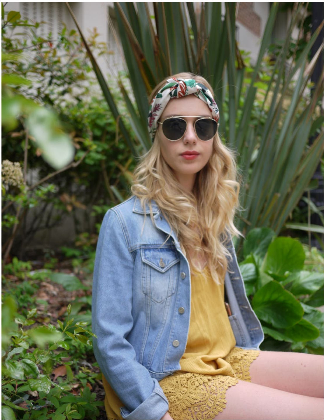
Headband Dima - Made in Paris