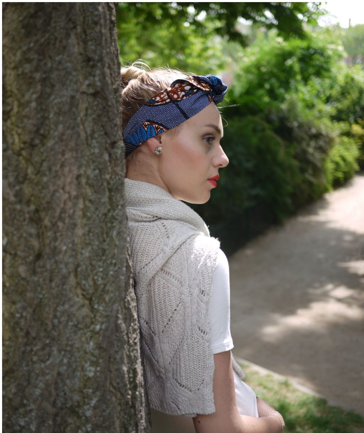
Headband Oba - Made in Paris