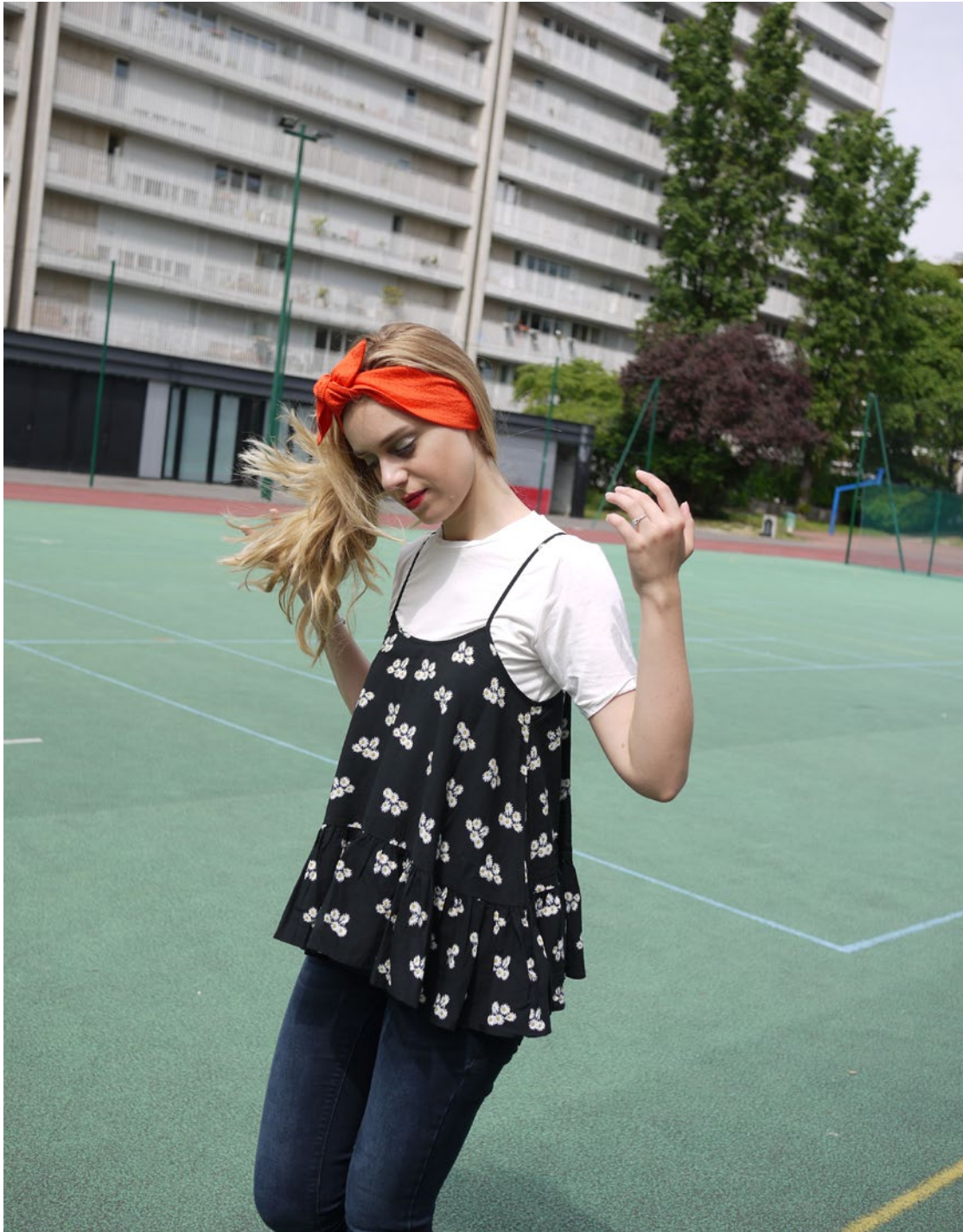
Headband Taelyn - Made in Paris