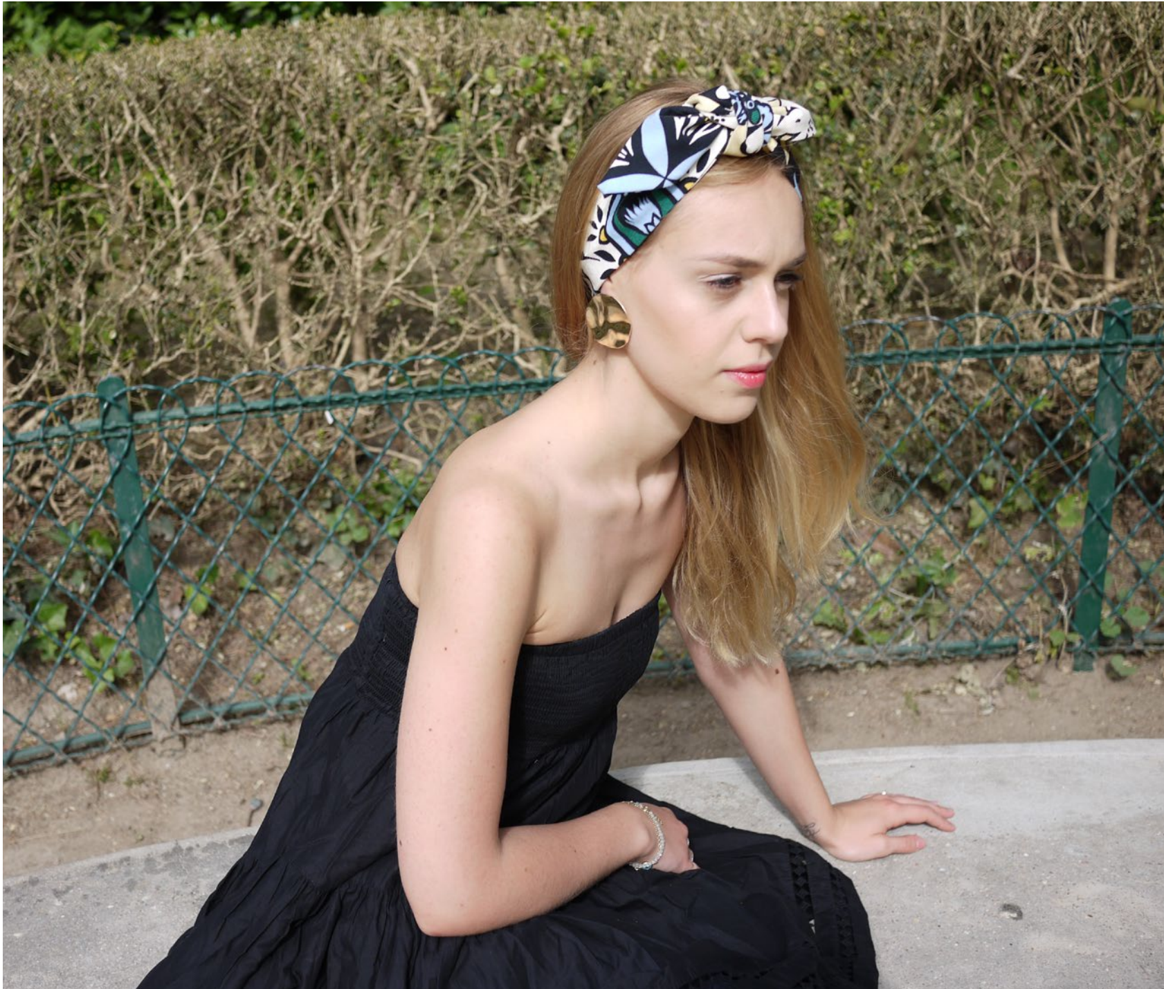
Headband Marissa - Made in Paris