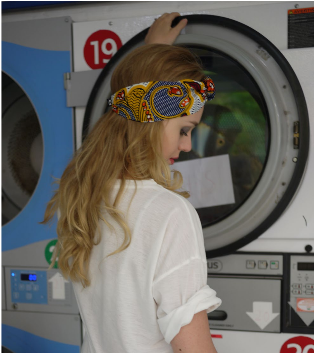
Headband Ona - Made in Paris