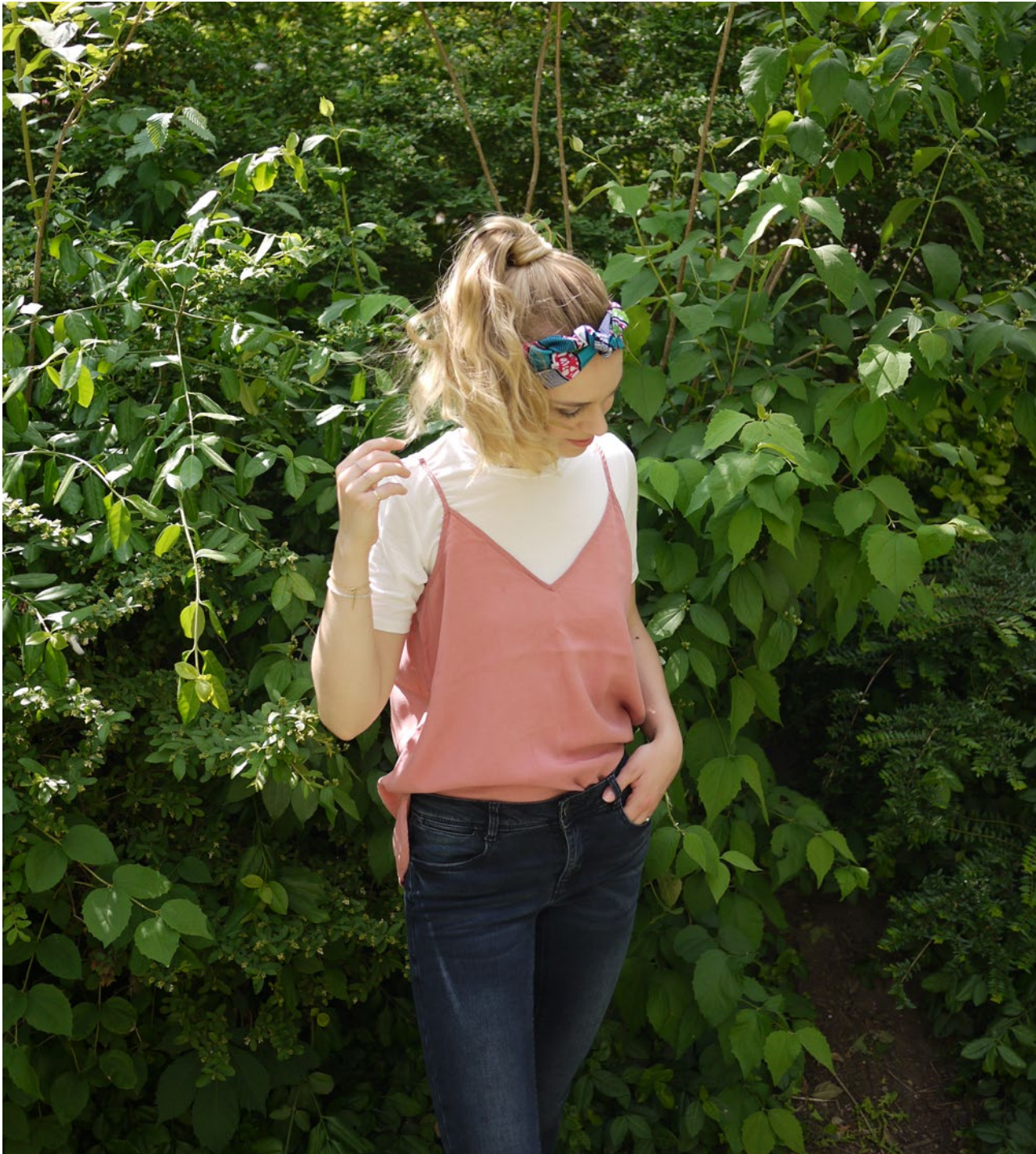
Turban Fang - Made in Paris