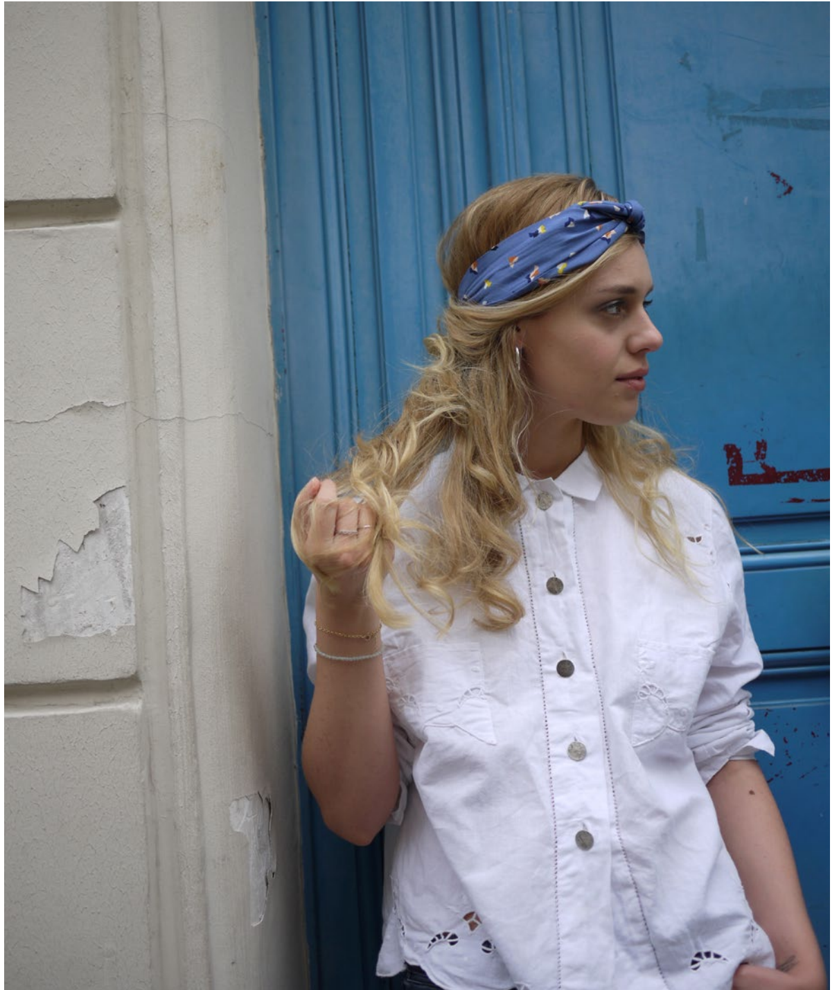
Headband Amirah - Made in Paris