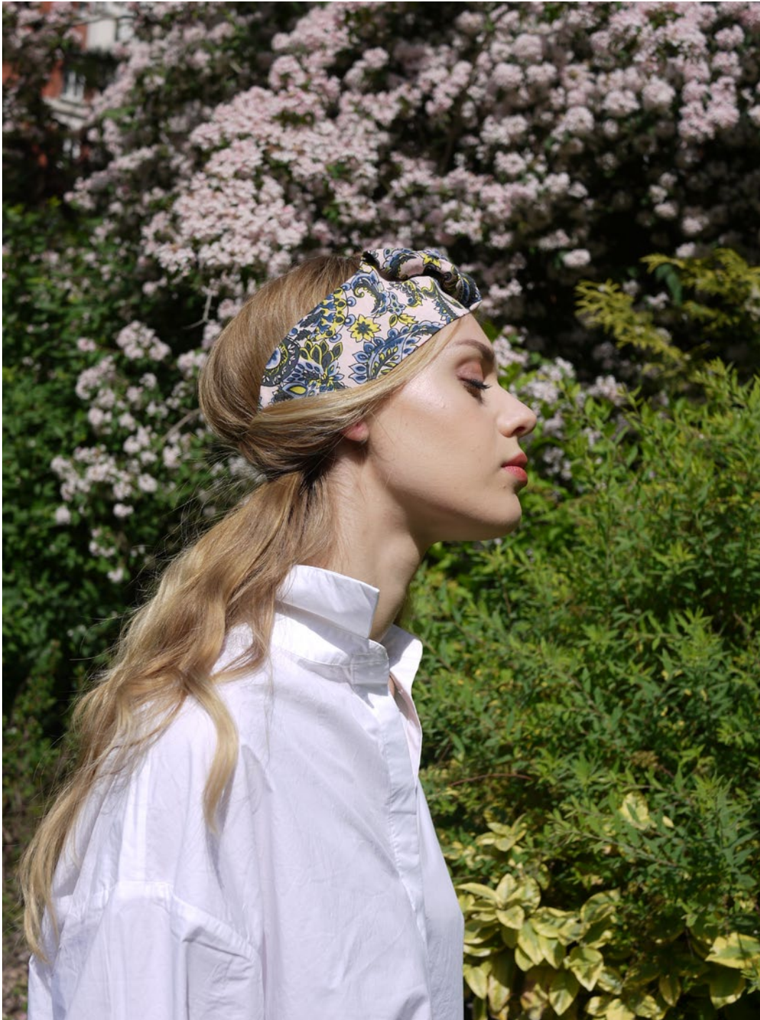
Headband Dixie- Made in Paris