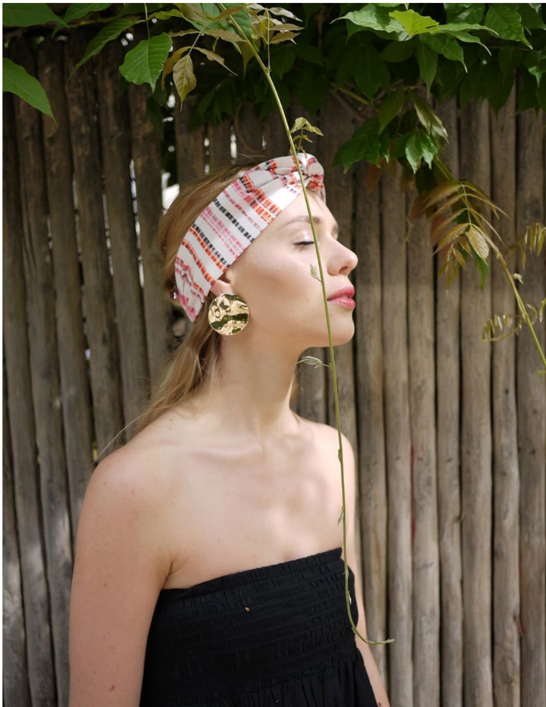
Headband Sandy - Made in Paris