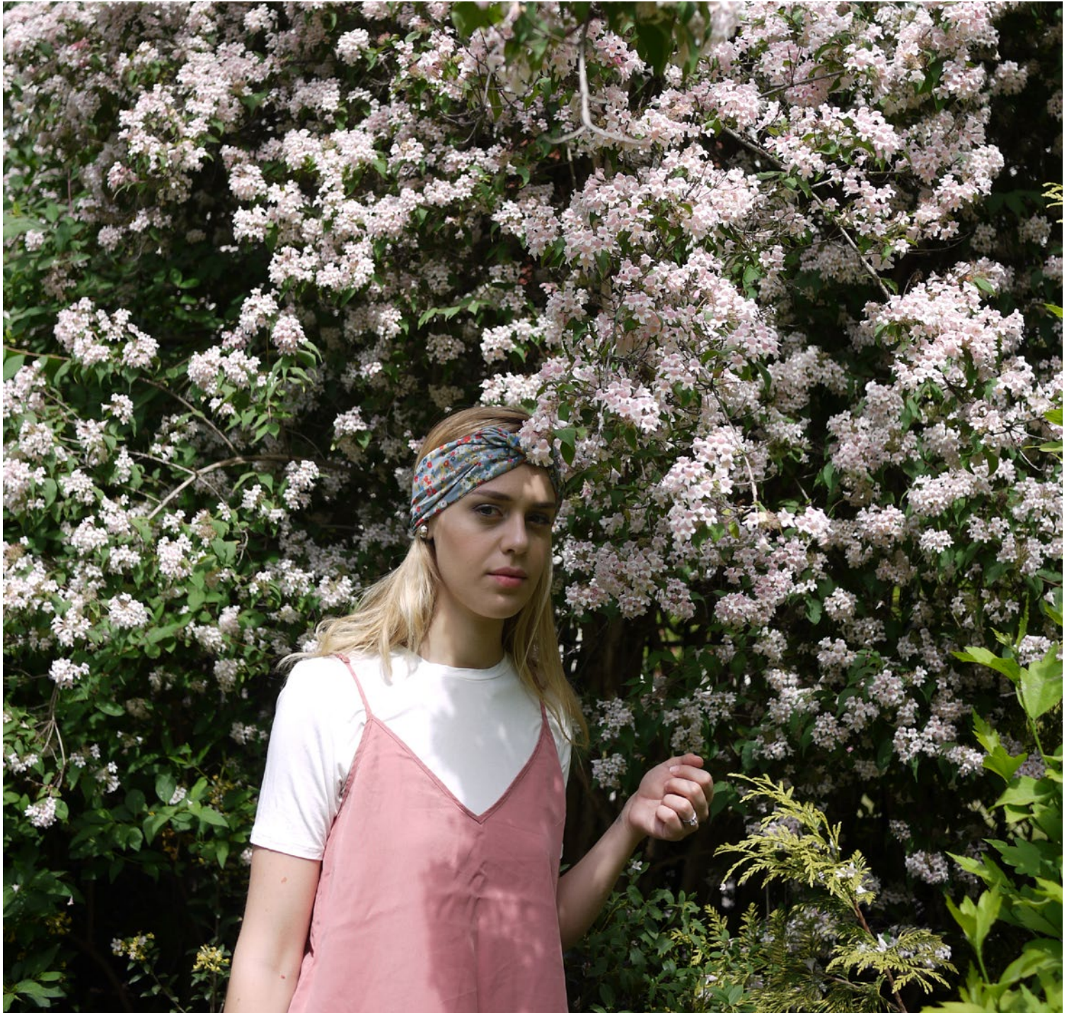
Headband Reese - Made in Paris