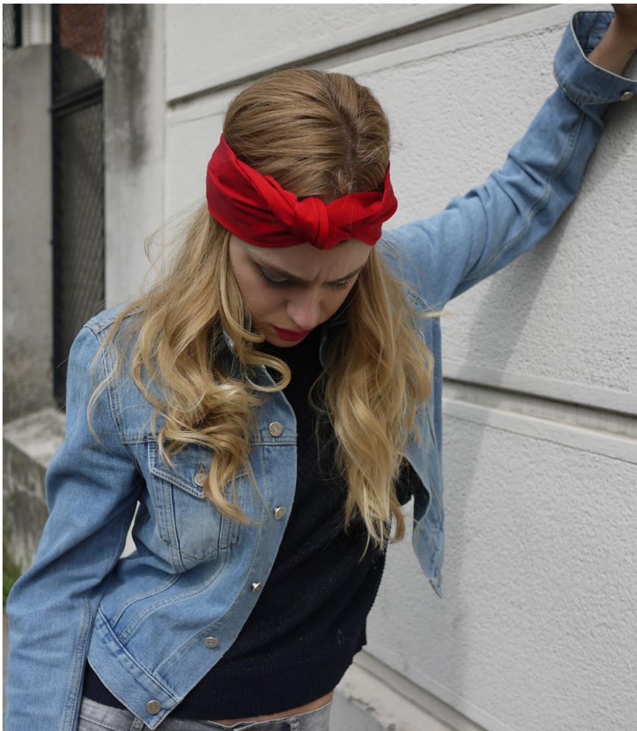
Headband Reda- Made in Paris