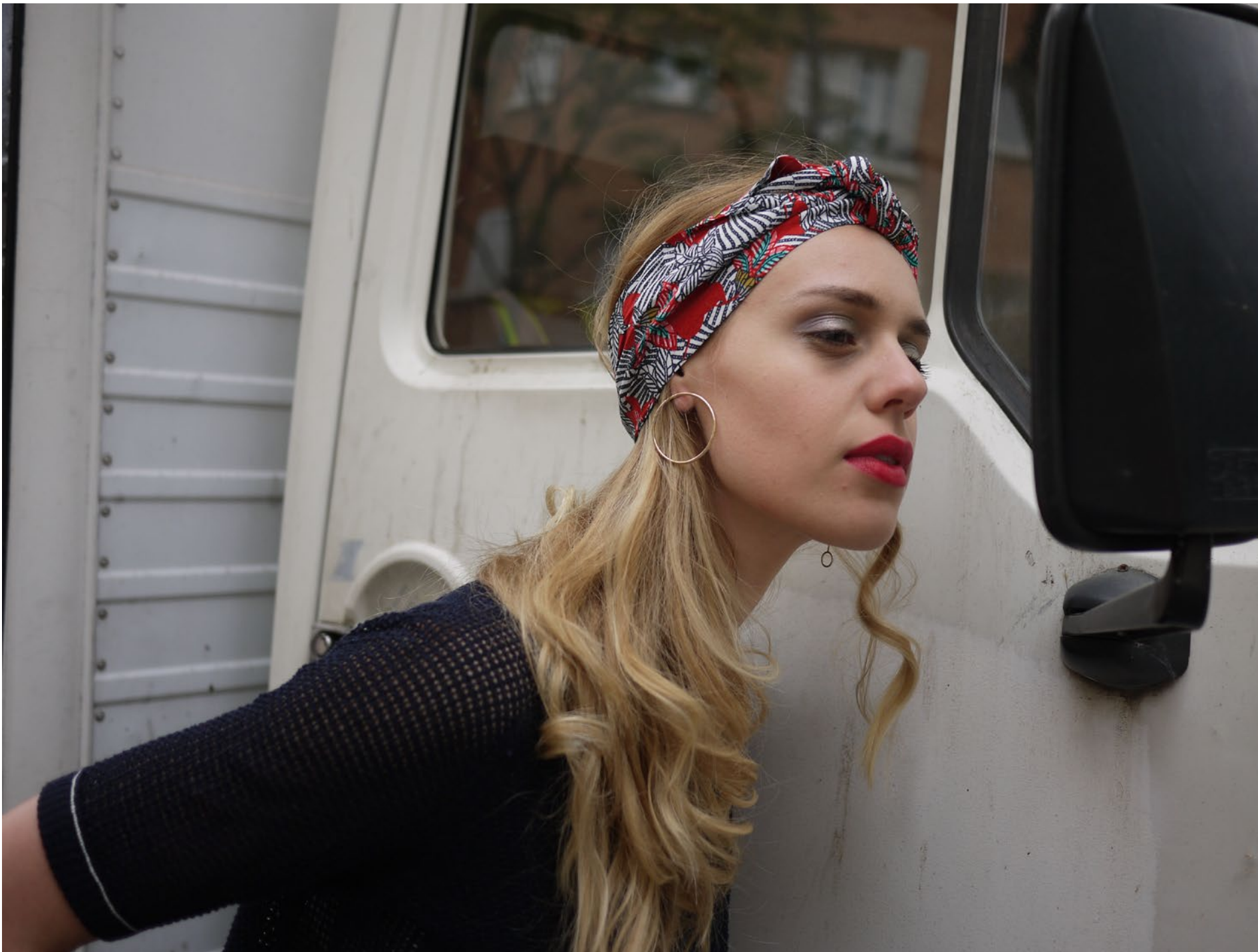
Headband Dynice - Made in Paris