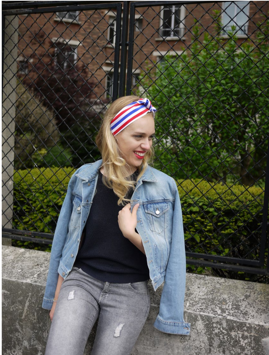
Headband Nati - Made in Paris